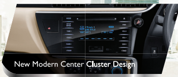
New Modern Center Cluster Design