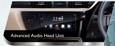
Advanced Audio Head Unit