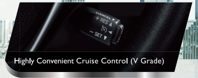
Highly Convenient Cruise Control (V Grade)