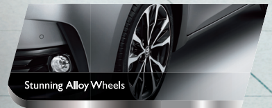
Stunning Alloy Wheels