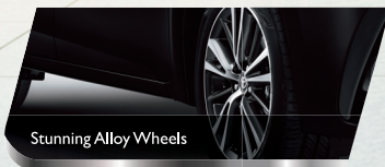
Stunning Alloy Wheels