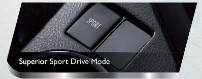
Superior Sport Drive Mode