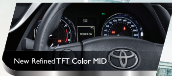
New Refined TFT Color MID