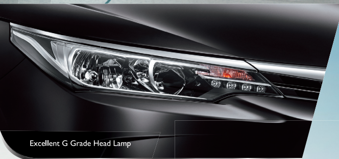
Excellent G Grade Head Lamp