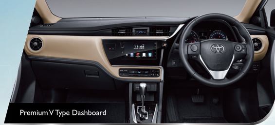
Premium V Type Dashboard