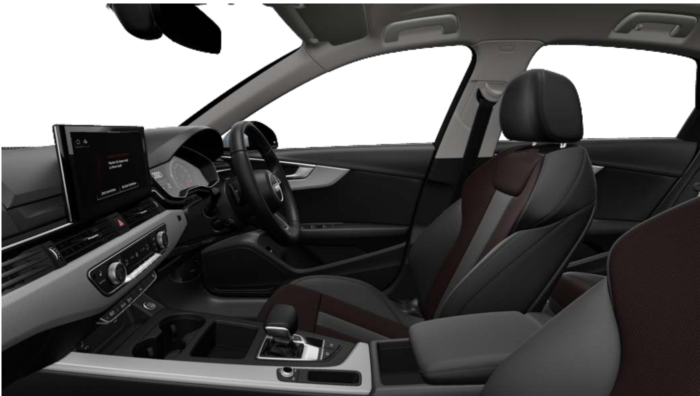
Red/Black Cloth Interior (Option Code AH)