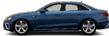
District Green 9W9W 1 Metallic €2,059