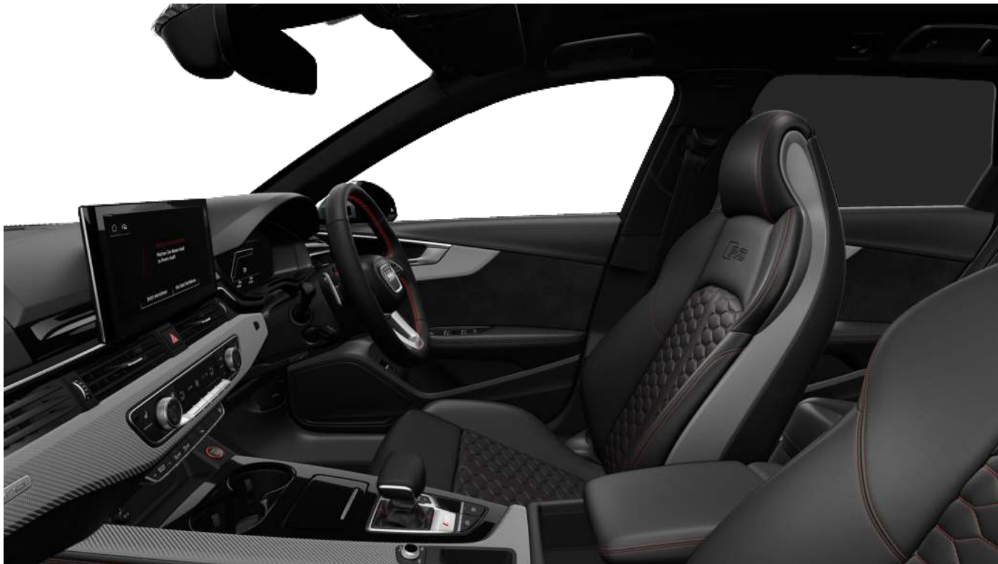
Black-Red/Black Leather Interior (Option Code QB)