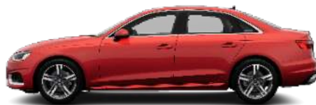
Progressive Red B1B1 Metallic €1,287