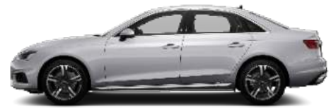
Floret Silver L5L5 2 Metallic €1,287