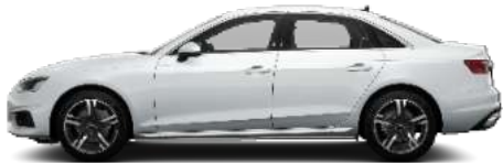
Glacier White 2Y2Y Metallic €1,287