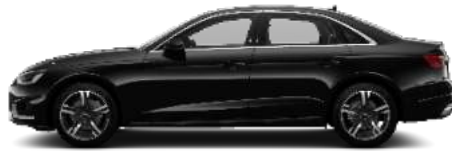
Brilliant Black A2A2 Solid €0