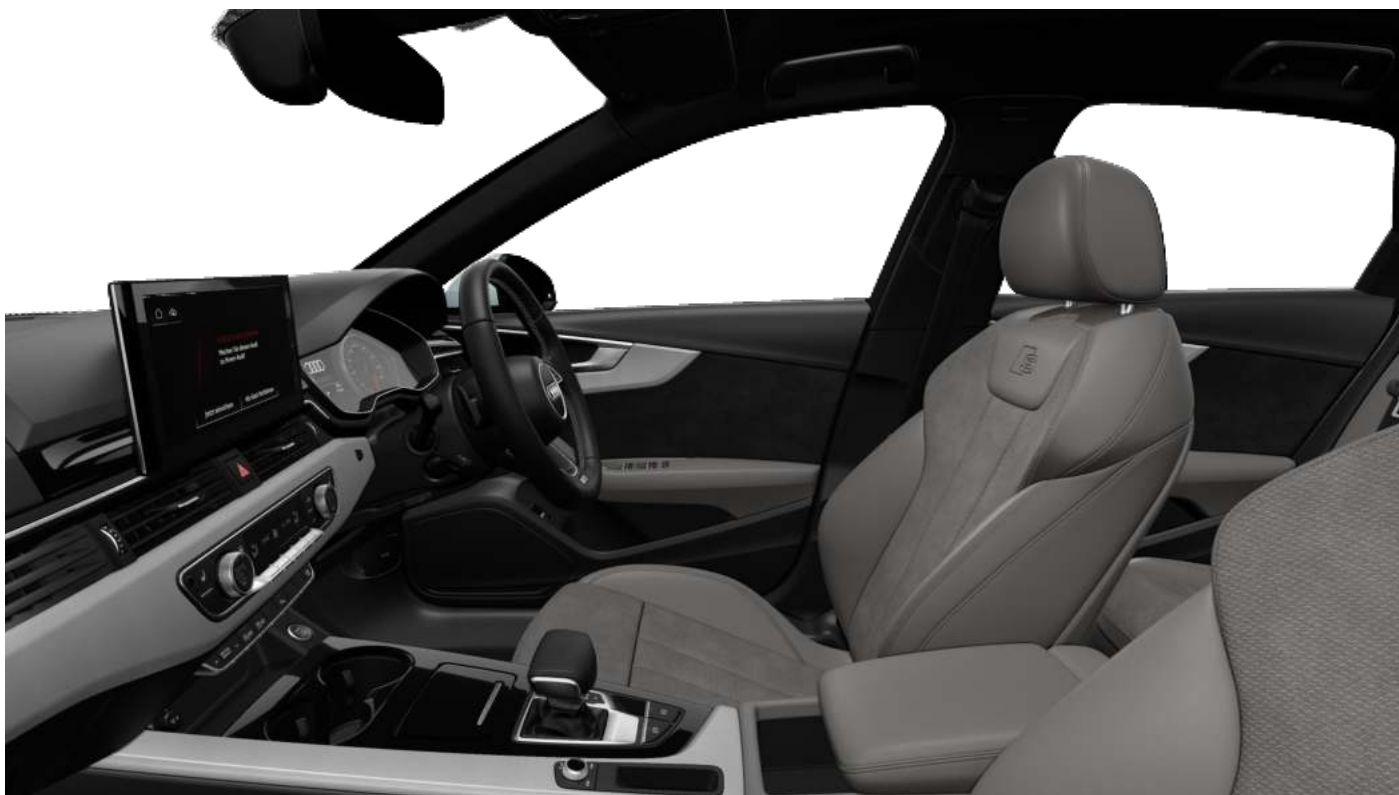
Grey/Black Dinamica® microfiber “Frequenz”/leather Interior (Option Code OQ)