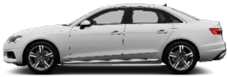
Arkona White Z9Z9 Solid €0