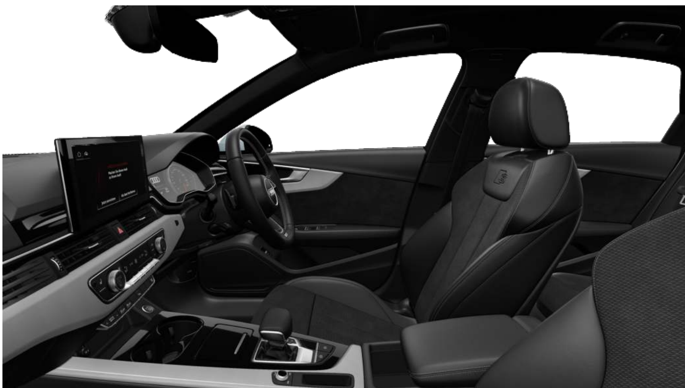
Black/Black Dinamica® microfiber “Frequenz”/leather Interior (Option Code EI)