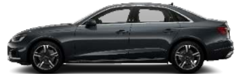
Manhattan Grey H1H1 2 Metallic €1,287