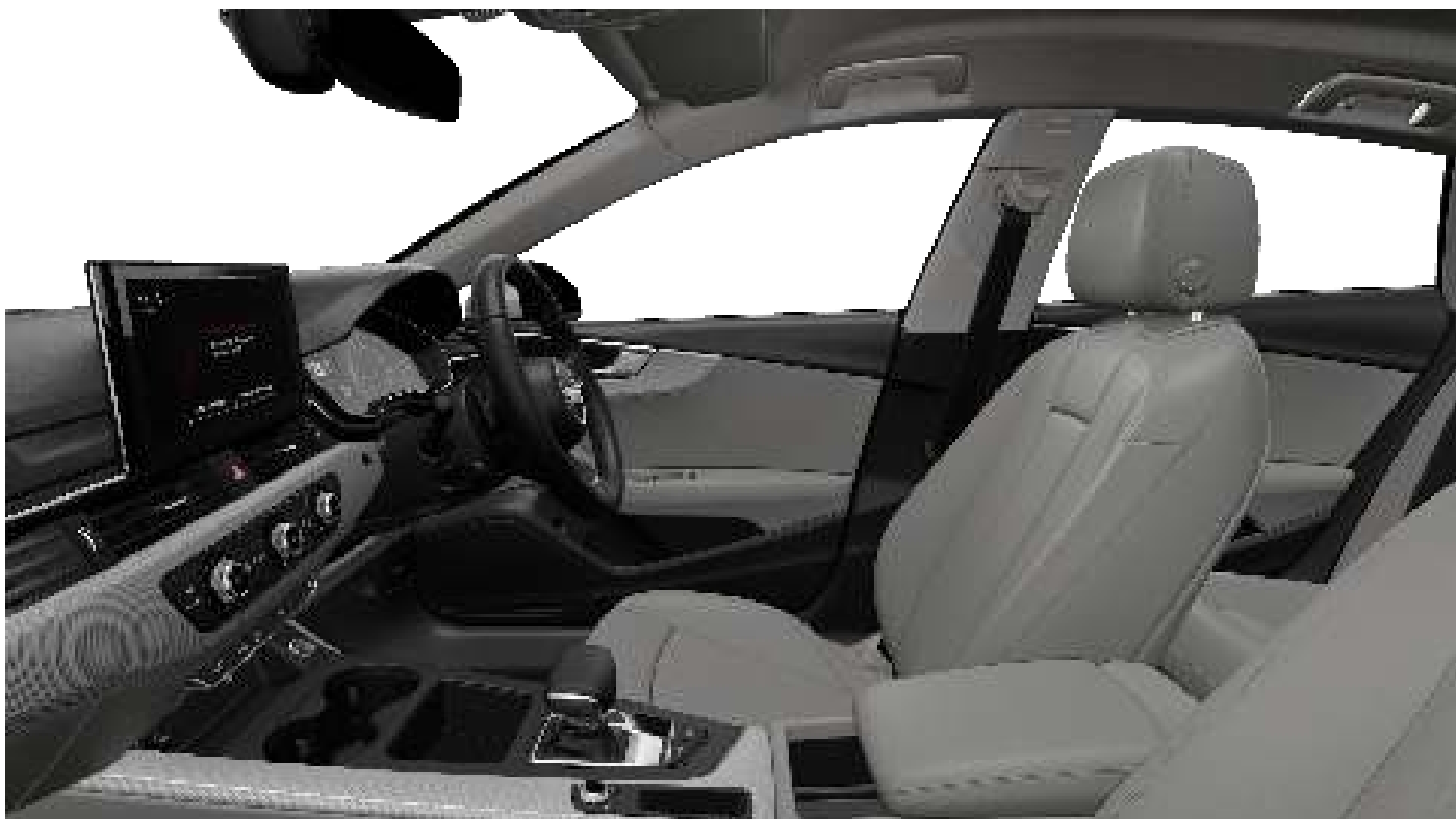
Grey/Black-Grey Leather Interior (Option Code EA)