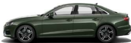
District Green M4M4 Metallic €1,287