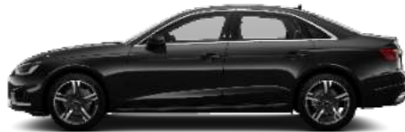
Mythos Black 0E0E Metallic €1,287