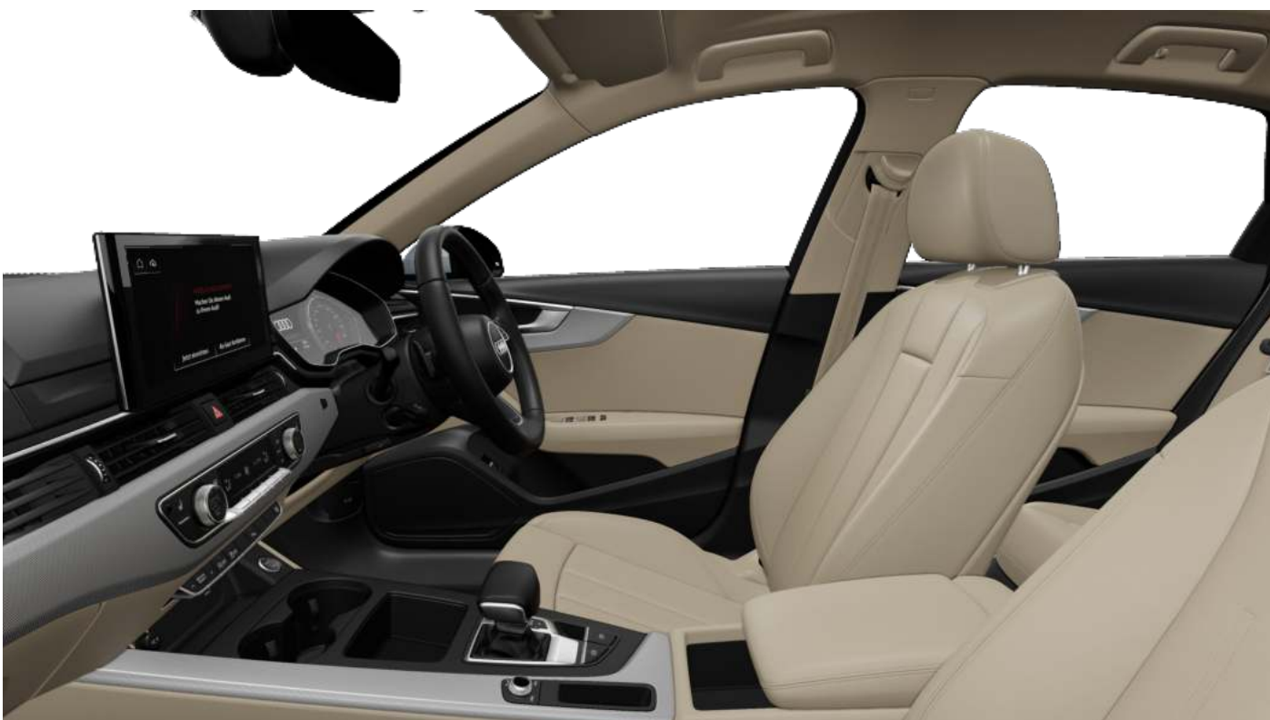
Beige/Black-Beige Leather Interior (Option Code EL)