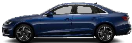
Navarra Blue 2D2D Metallic €1,287