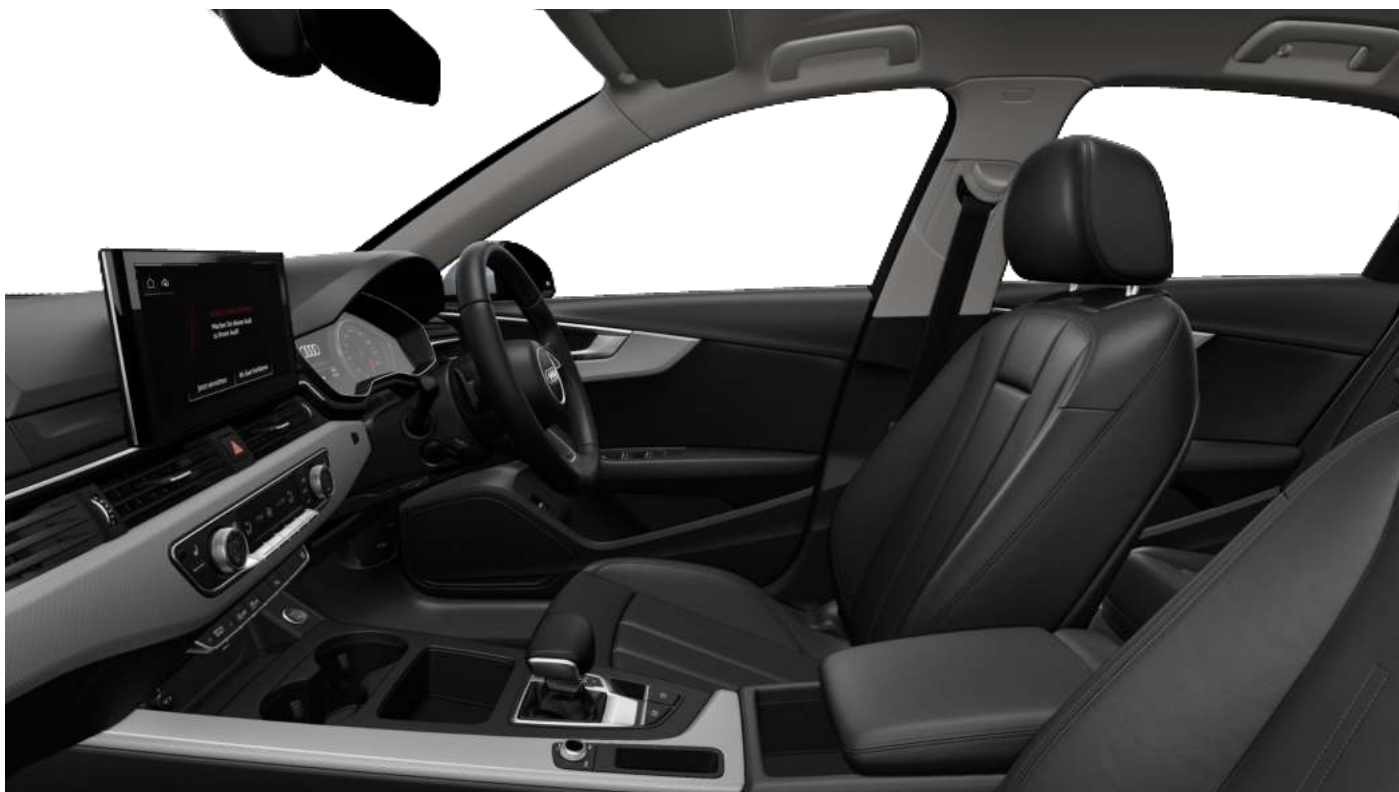
Black/Black Leather Interior (Option Code YM)