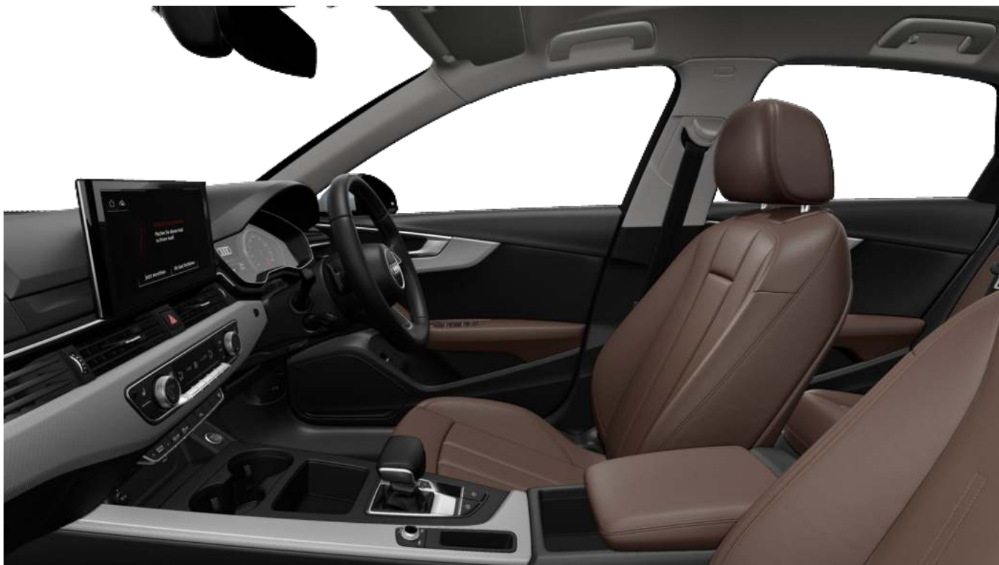
Okapi Brown/Black Leather Interior (Option Code BC)