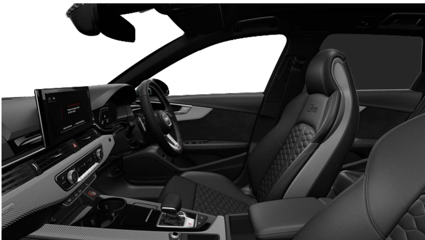
Black-Rock Grey/Black Leather Interior (Option Code UB)