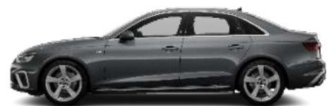
Daytona Grey 6Y6Y 1 Pearl Effect €1,323