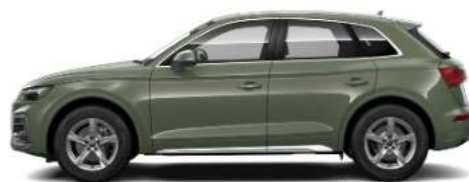
District Green M4M4 Metallic €1,154