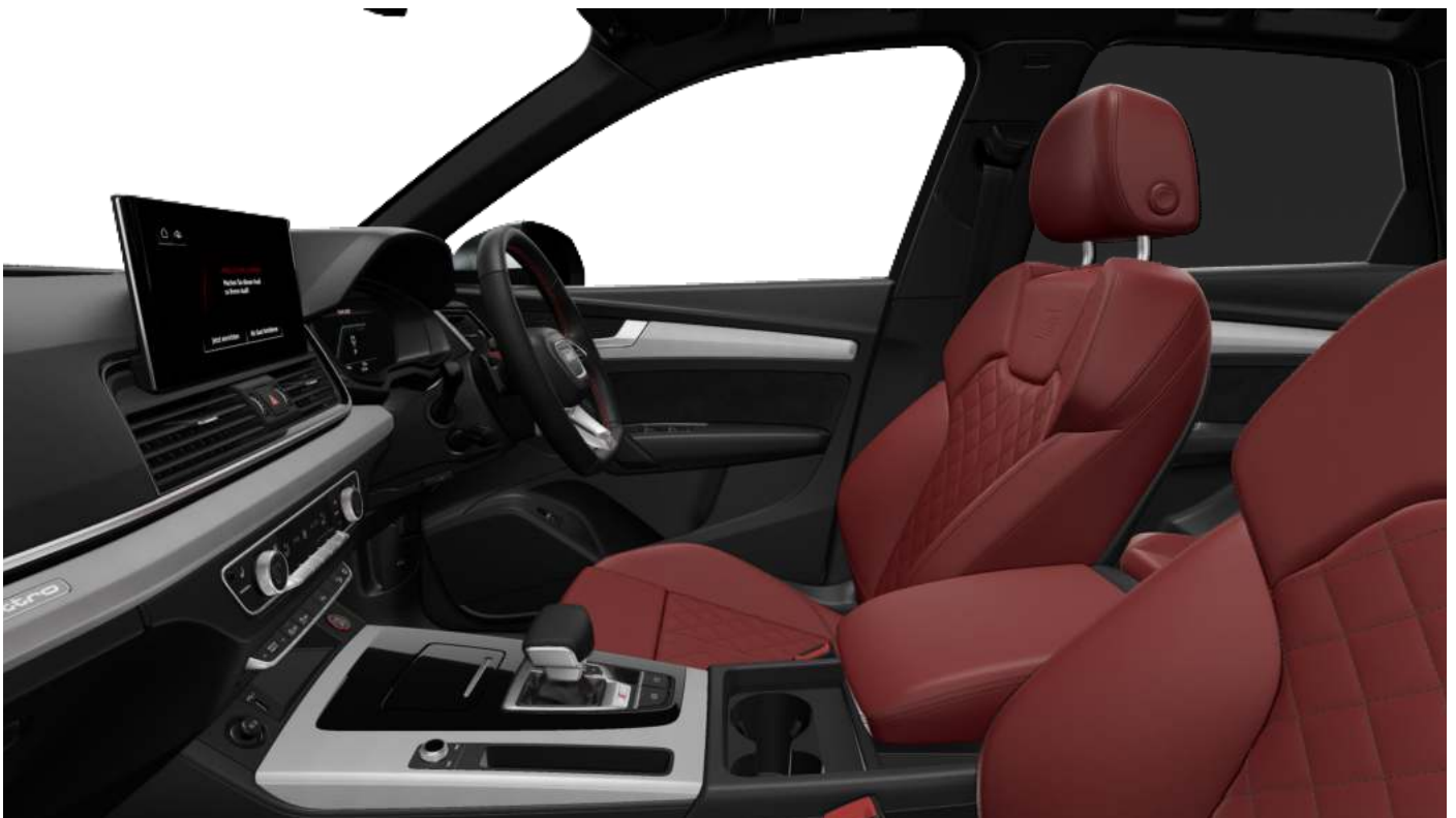
Rotor Grey/Black Sequence Cloth/Leather Combination Interior (Option Code AU)