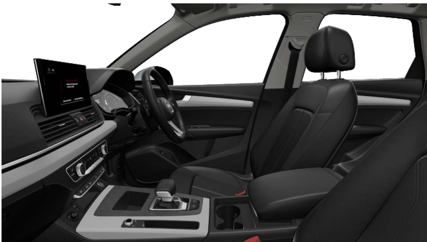
Black/Black Leather Interior (Option Code YM)