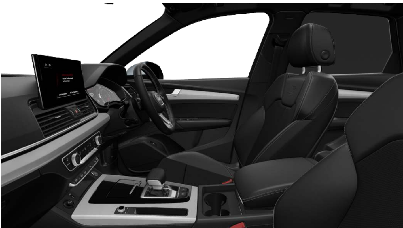
Black-Rock Grey/Black Sequence Cloth/Leather Combination Interior (Option Code EI)