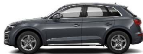
Manhattan Grey H1H1 Metallic €1,154