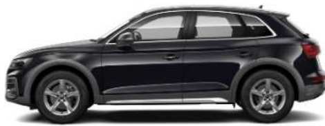
Brilliant Black A2A2 2 Solid €0