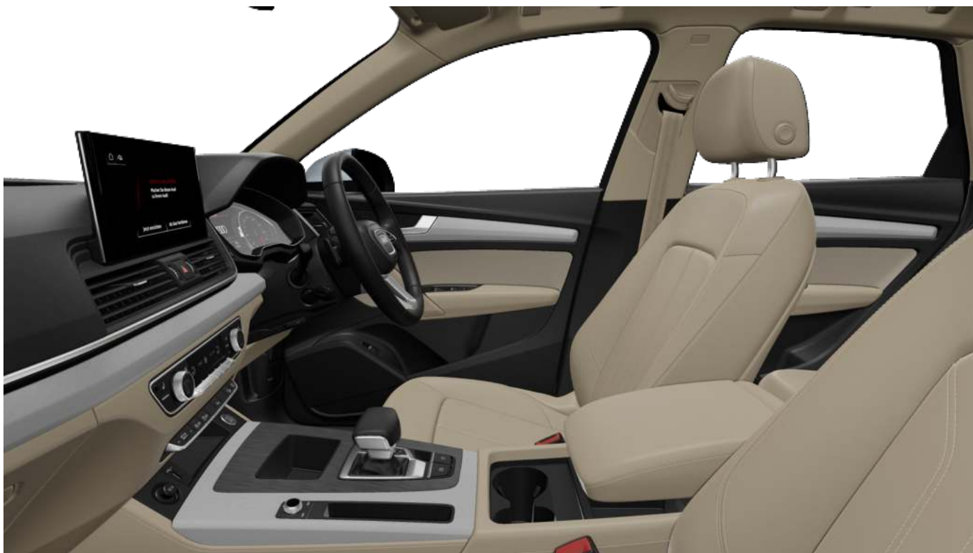
Beige/Black-Beige Leather Interior (Option Code EL)