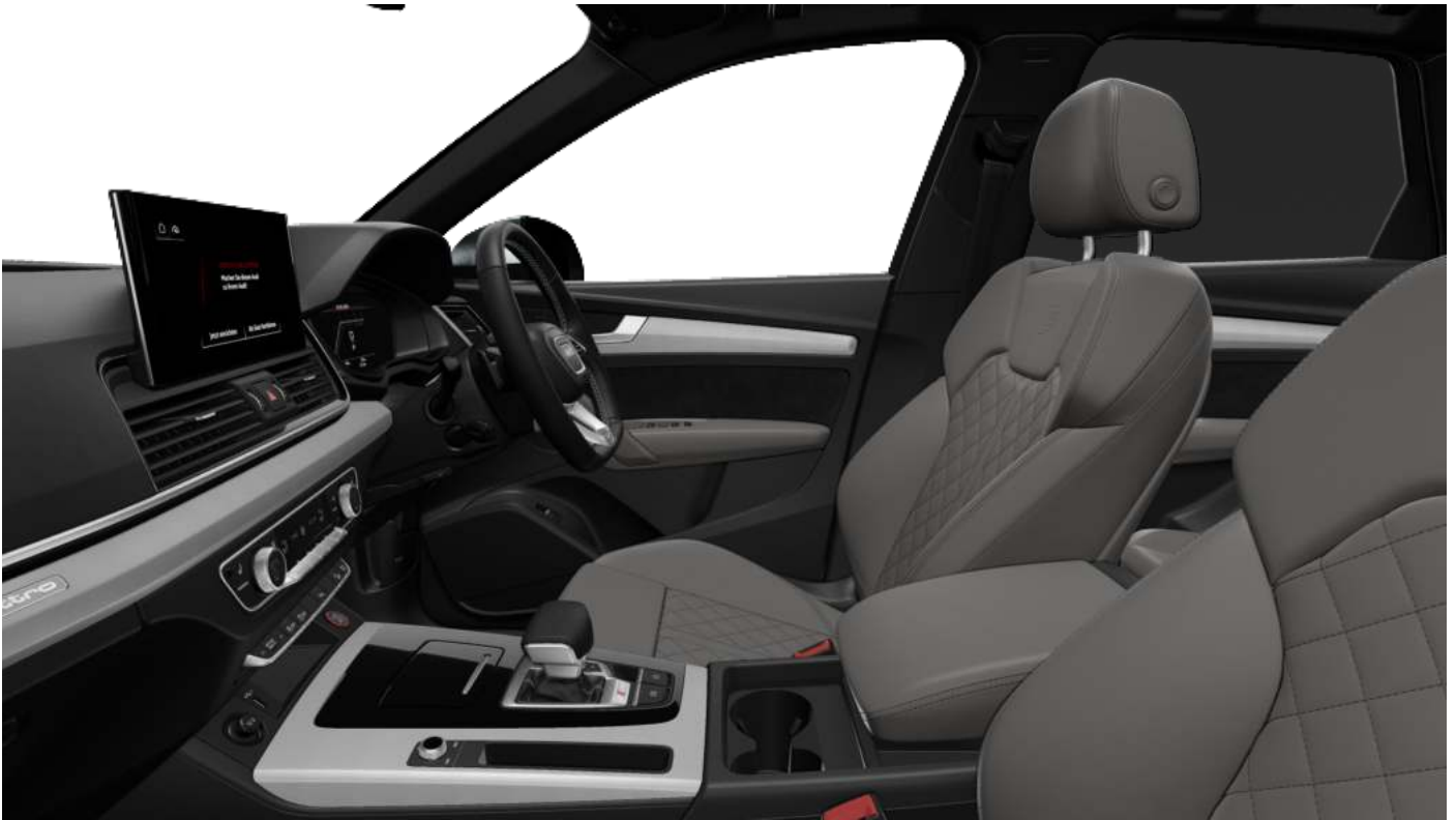
Rotor Grey/Black Leather Interior (Option Code OQ)