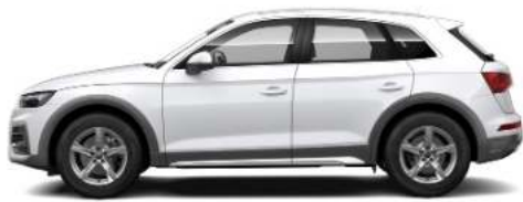
Arkona White Z9Z9 Solid €0