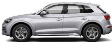
Floret Silver L5L5 Metallic €1,154