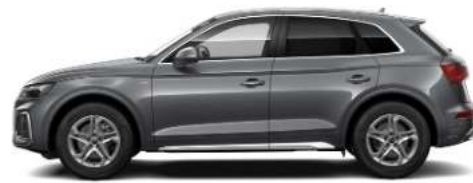
Daytona Grey 6Y6Y 1 Pearl Effect €1,142