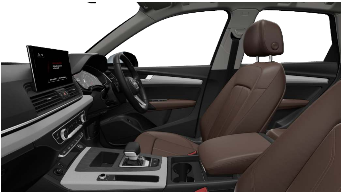
Okapi Brown/Black Leather Interior (Option Code BC)