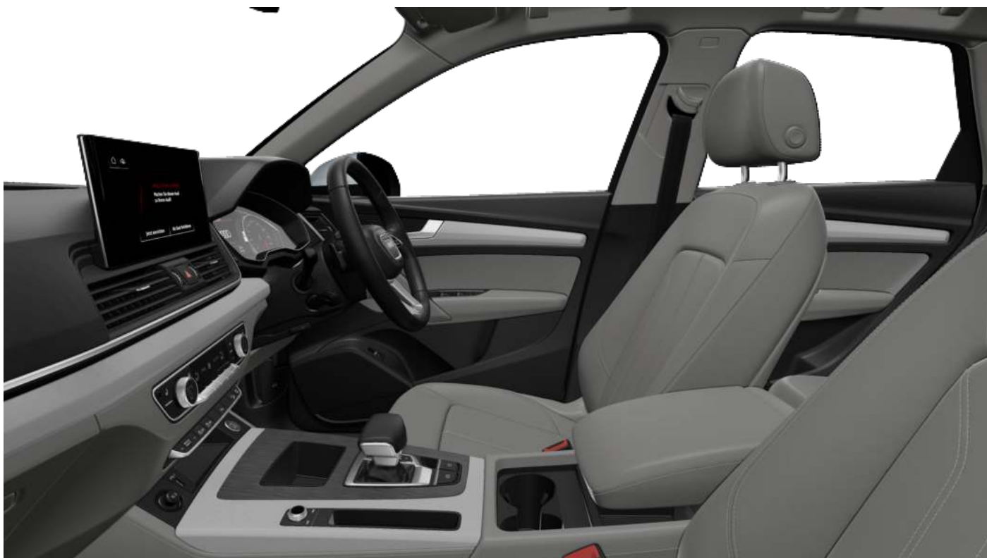
Grey/Black-Grey Leather Interior (Option Code EA)