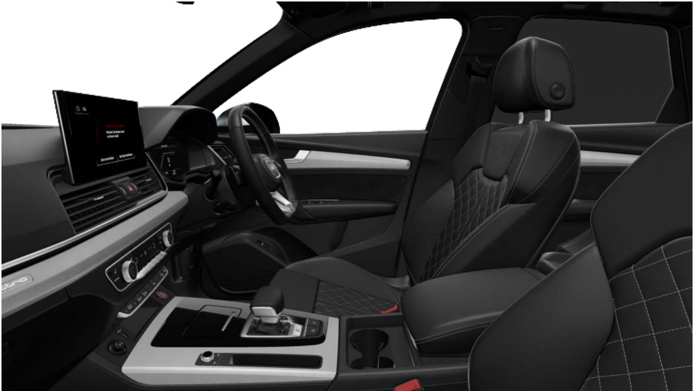
Black-Rock Grey/Black Leather Interior (Option Code EI)