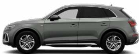
Chronos Grey T7T7 1 Metallic €1,154