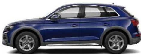
Navarra Blue 2D2D Metallic €1,154