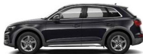
Mythos Black 0E0E Metallic €1,154