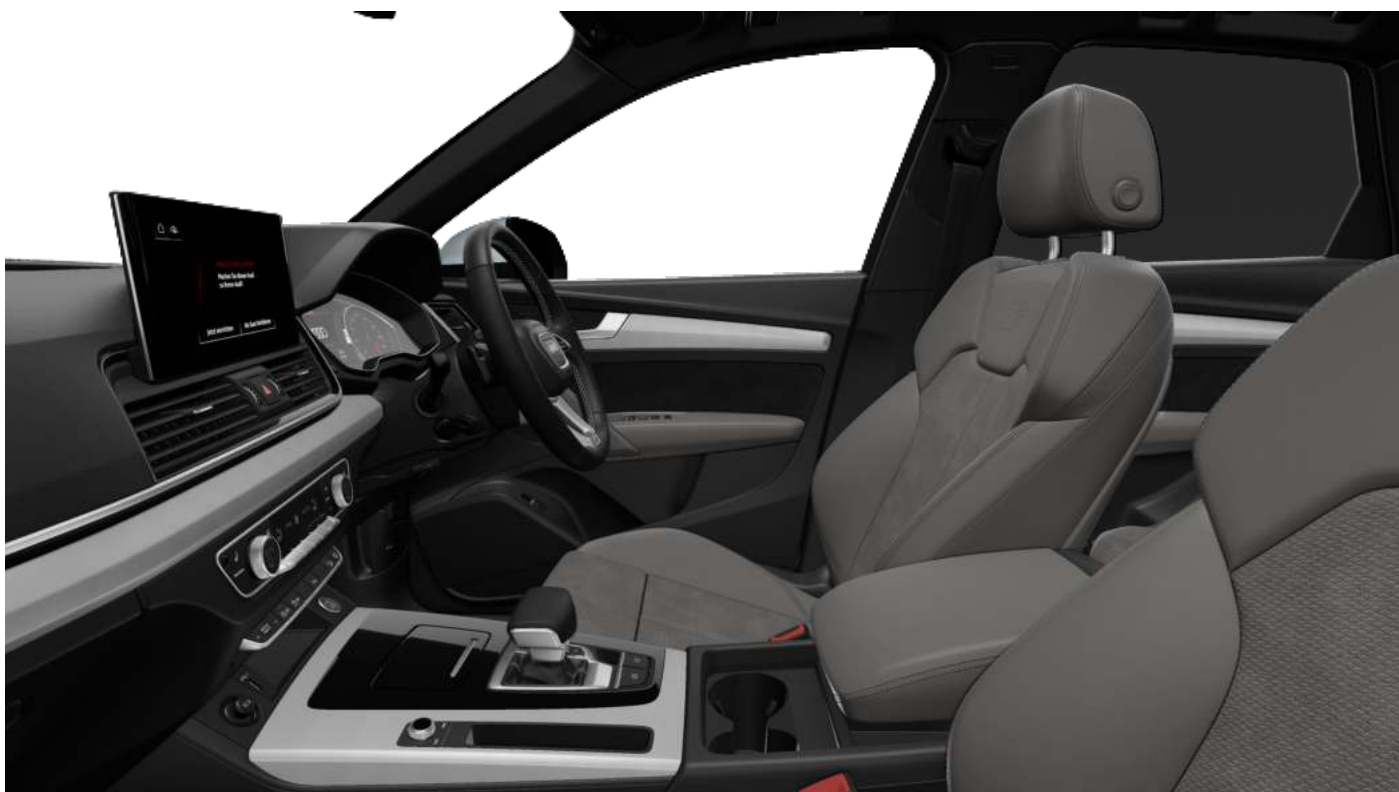
Rotor Grey/Black Sequence Cloth/Leather Combination Interior (Option Code OQ)