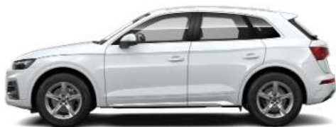
Glacier White 2Y2Y Metallic €1,154