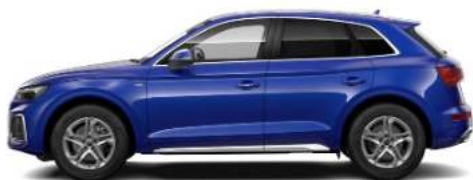
Ultra Blue 6I6I 1 Metallic €1,154