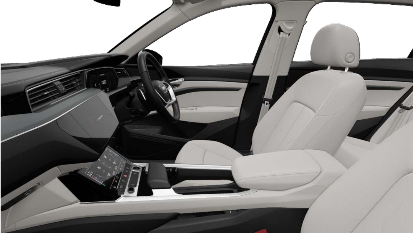
Beige-Grey/Grey-Beige Leather Interior (Option Code HQ)