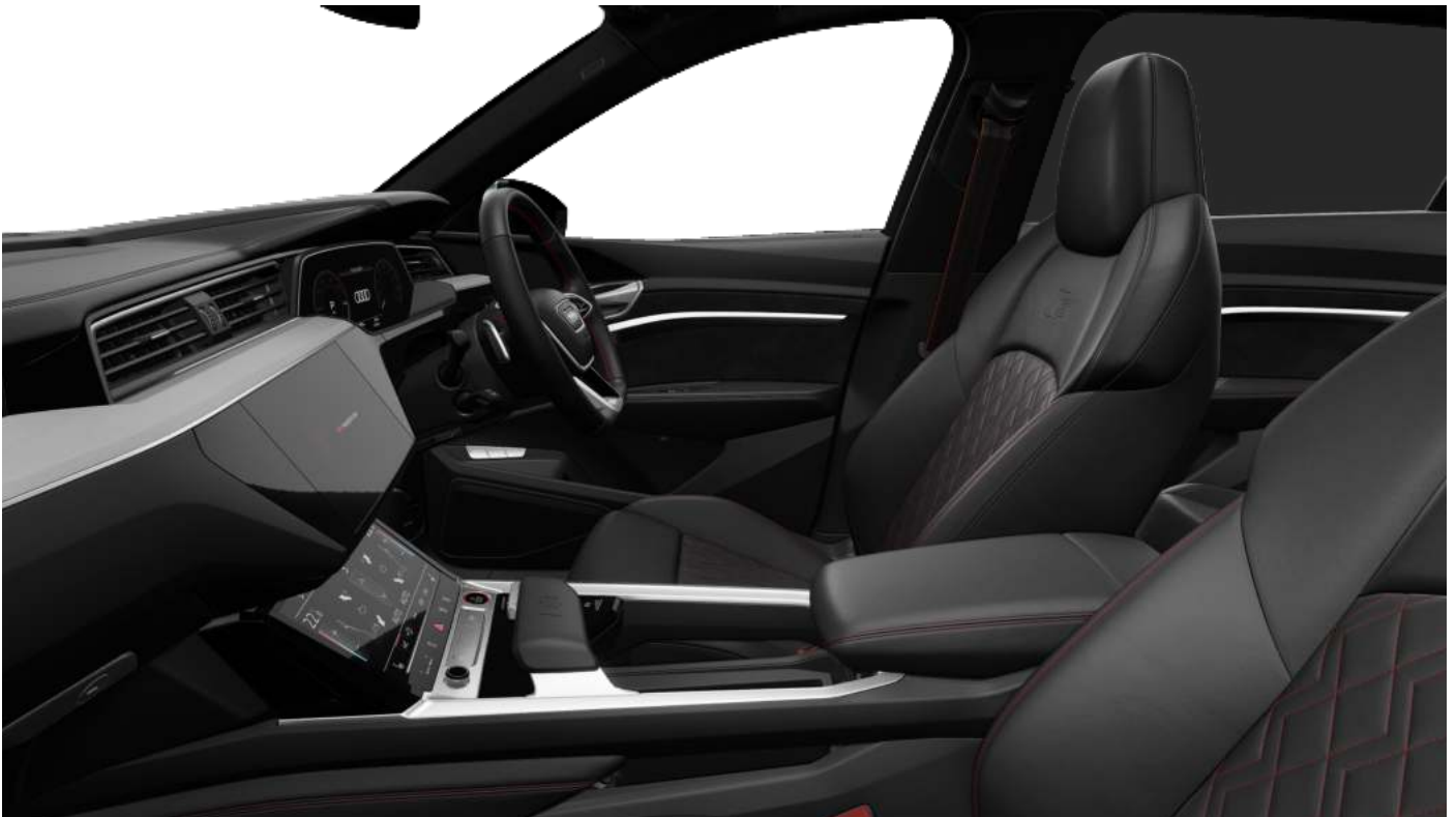
Black-Red/Black Leather Interior (Option Code VA)