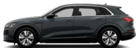
Manhattan Grey Metallic H1H1 1 €1,348