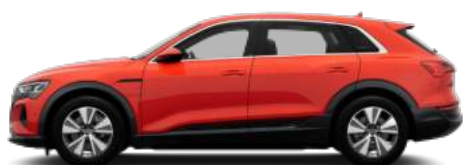
Soneira Red Metallic G1G1 €1,348