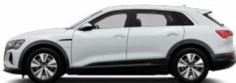
Glacier White Metallic 2Y2Y €1,348