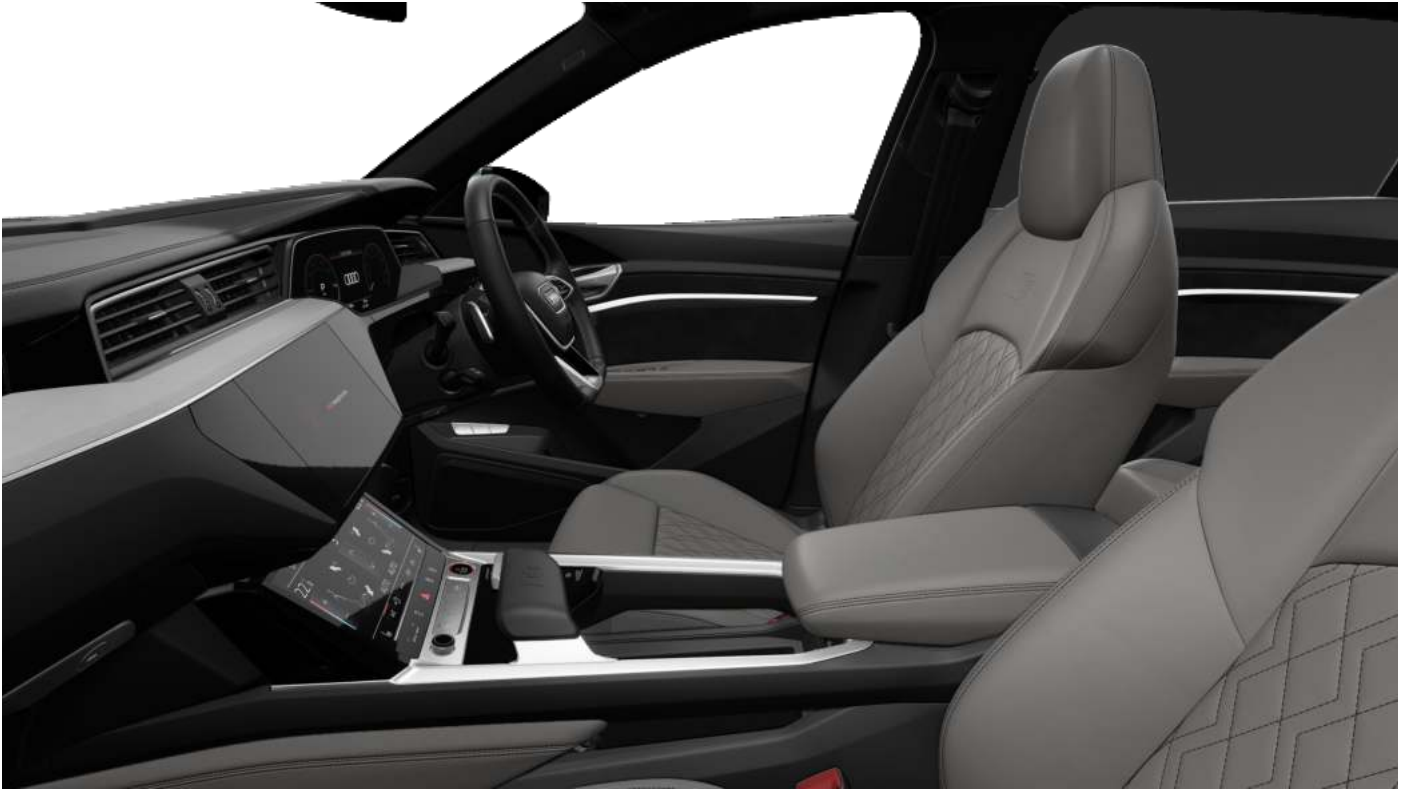
Rotor Grey-Anthracite/Black Leather Interior (Option Code TJ)