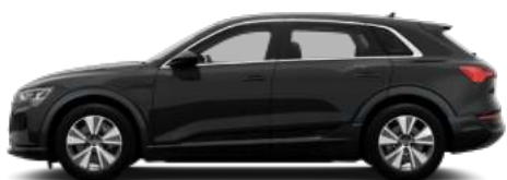
Mythos Black Metallic 0E0E €1,348