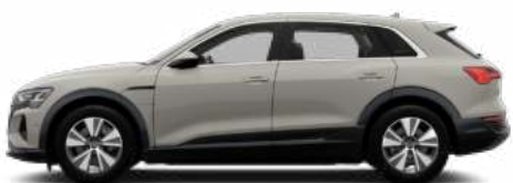
Siam Beige Metallic 7M7M 1 €1,348