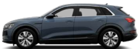
Plasma Blue Metallic 3D3D €1,348