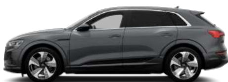
Daytona Grey Pearl Effect 6Y6Y 2 €1,348