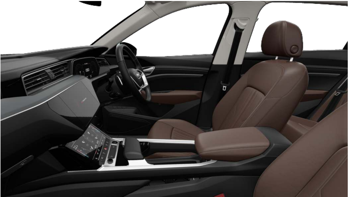
Brown-Grey/Black Leather Interior (Option Code MN)