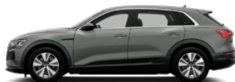
Chronos Grey Metallic Z7Z7 €1,348