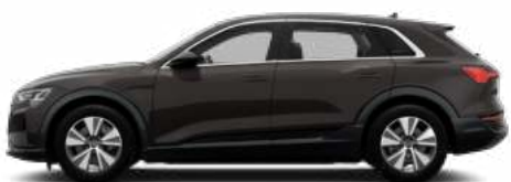
Madeira Brown Metallic 9E9E €1,348