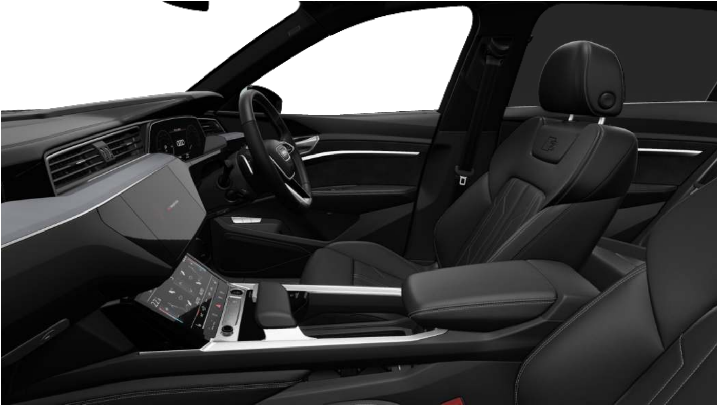
Black-Grey/Black Leather Interior (Option Code MP)