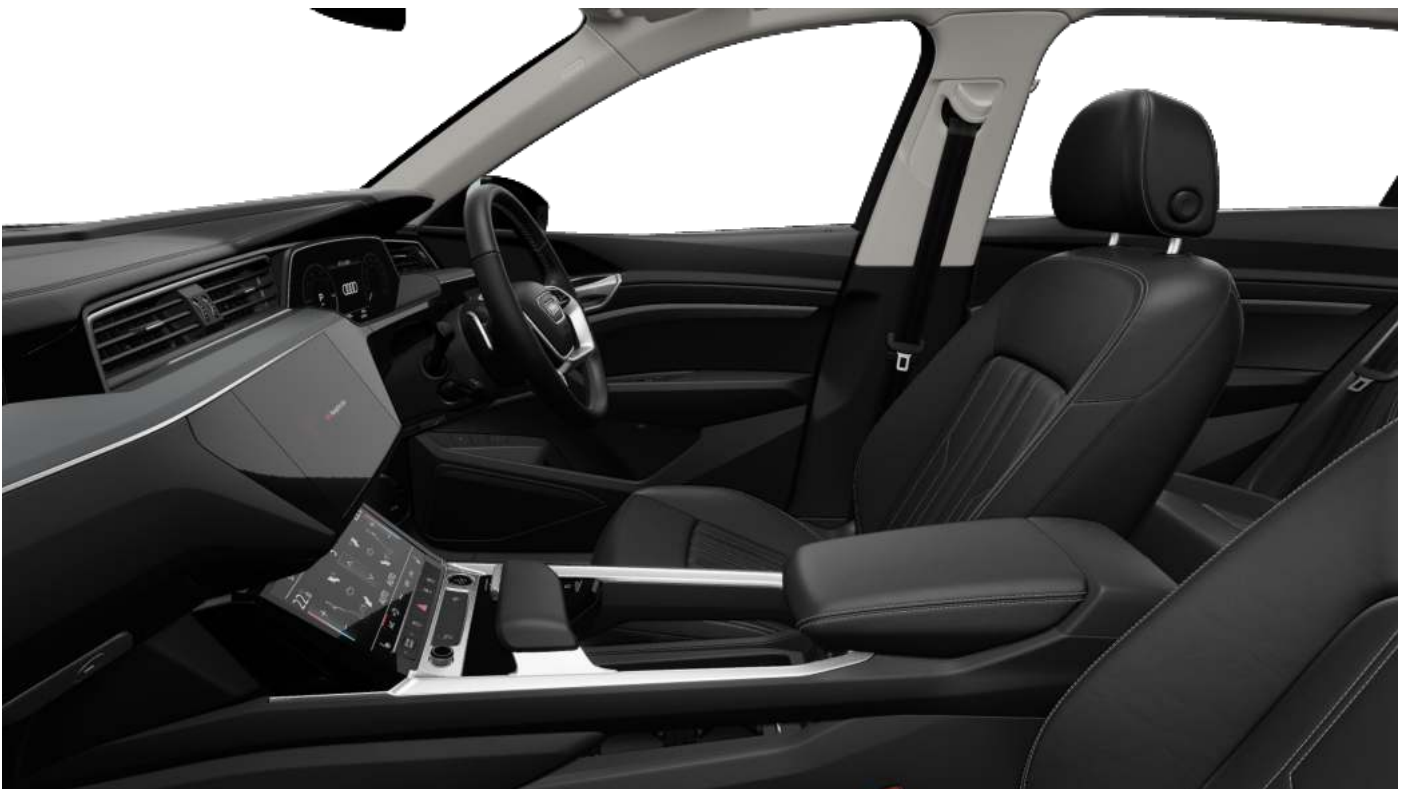
Black-Grey/Black Leather Interior (Option Code MP)