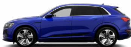
Ultra Blue Metallic 6I6I 2 €1,348