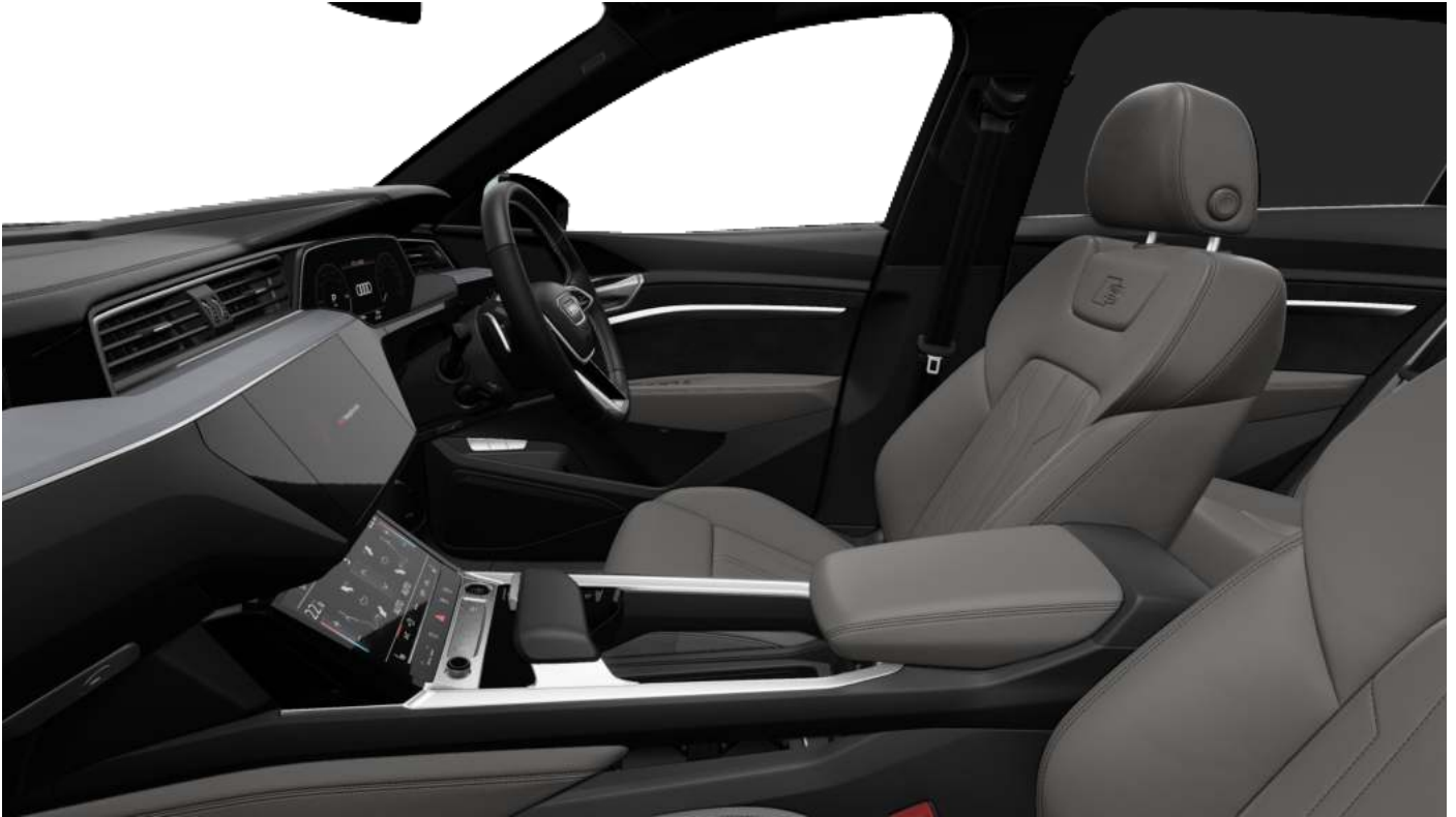
Rotor Grey-Anthracite/Black Leather Interior (Option Code TJ)