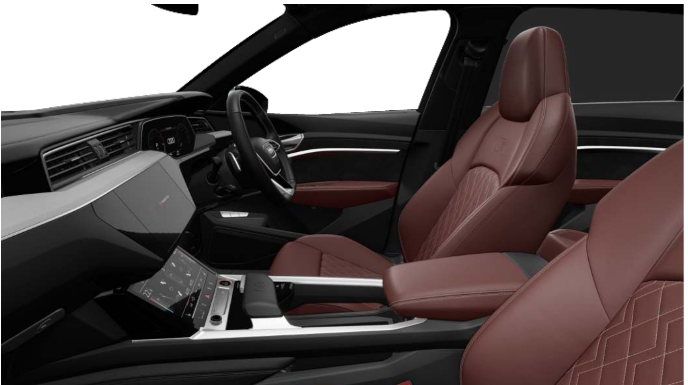
Arras Red-Agate Grey/Black Leather Interior (Option Code MD)