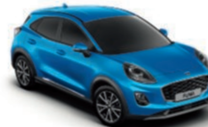
Desert Island Blue