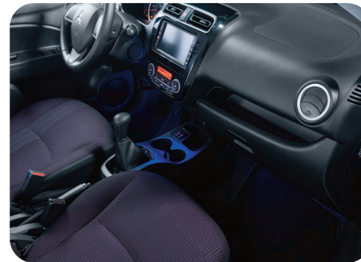
Centre console illumination ■ Blue light Part No. MZ590838EX