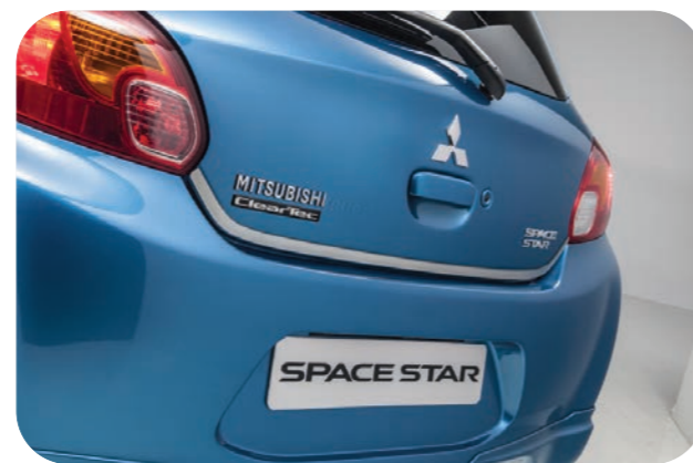
Tailgate garnish ■ Silver Part No. MZ314729