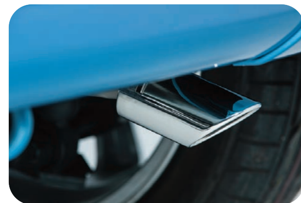
Exhaust finisher Part No. MZ330438