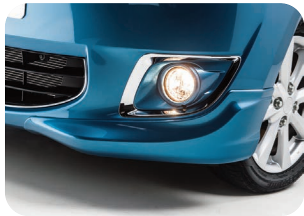
Chrome plated fog lamp garnish ■ Fog lamp surroundings Part No. MZ330457