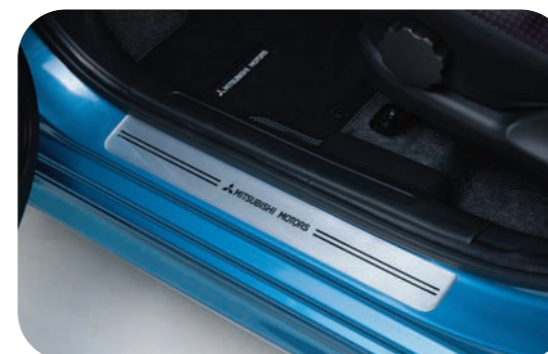
Entry guards ■ Front & rear set Part No. MZ314730