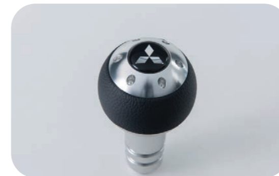
Gearshift knob ■ Alloy & leather combination (Standard on 1.2L Intense) Part No. MZ525507EX