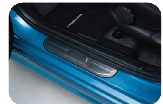
Stainless entry guards ■ Front & rear set Part No. MZ330636