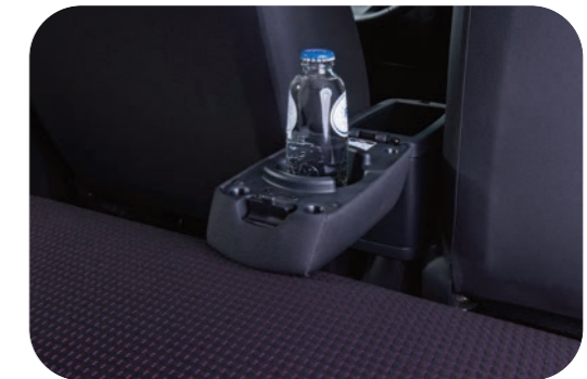
Arm rest ■ Centre console Part No. MZ330444