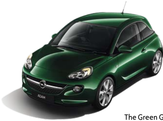
The Green Gatsby Two-coat metallic*