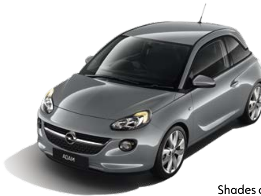
Shades of Grey Two-coat metallic*