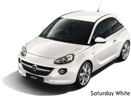
Saturday White Fever Brilliant*