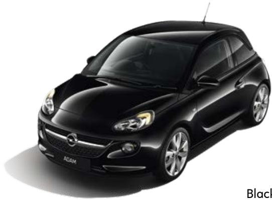
Black Jack Two-coat metallic*