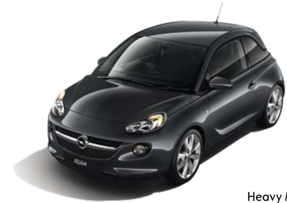
Heavy Metal Two-coat metallic*