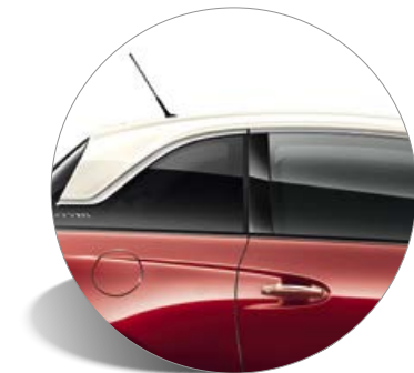
White my Fire Solid