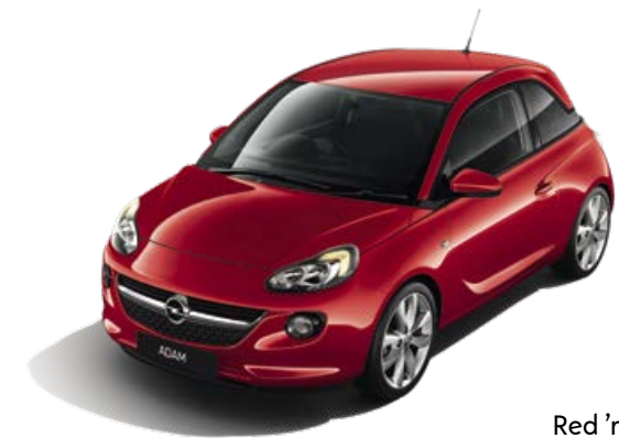
Red 'n' Roll Brilliant*