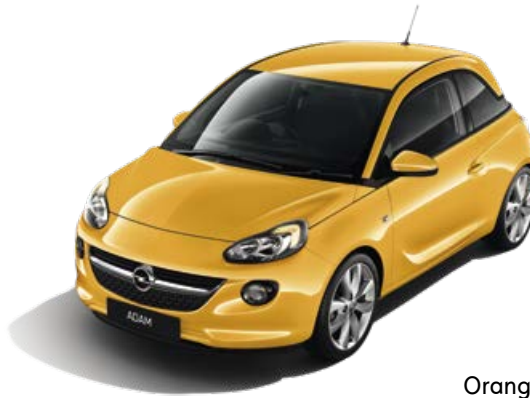
Orange Alert Solid

Please refer to the latest ADAM Price and Specification Guide, available to download from www.opel.ie for details of colour prices.