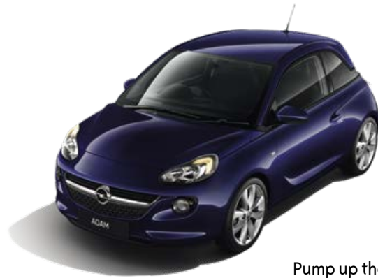
Pump up the Blue Two-coat premium*