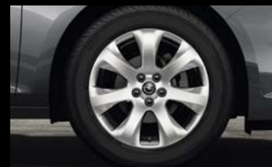
16-inch 7-spoke alloy wheels.