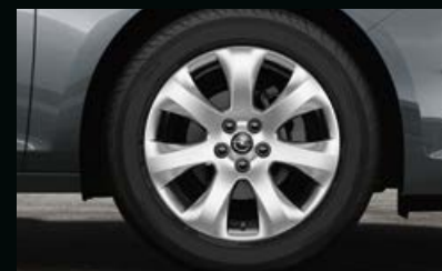
16-inch 7-spoke alloy wheels.

For details of the complete Astra Saloon line-up, please see the Astra Price and Specification guide available to download from www.opel.ie