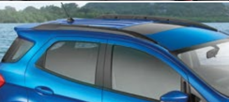
Fun Roof with Roof Rails