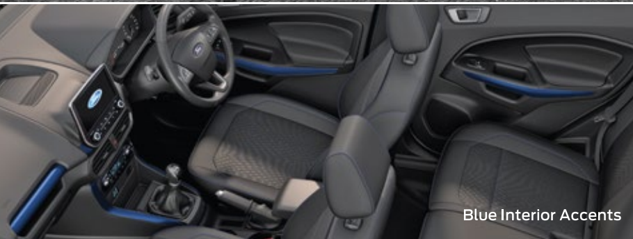
Blue Interior Accents