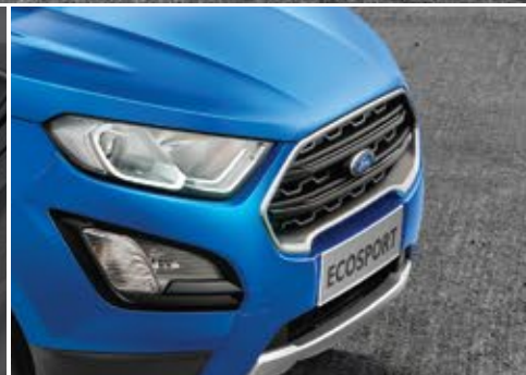
Chrome Enhanced Black Painted Grille