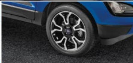
Diamond Cut R17(205/50 R17) Alloy Wheels

Other Features: Decal, Sporty Pedal, Front and Rear Bumper Applique.