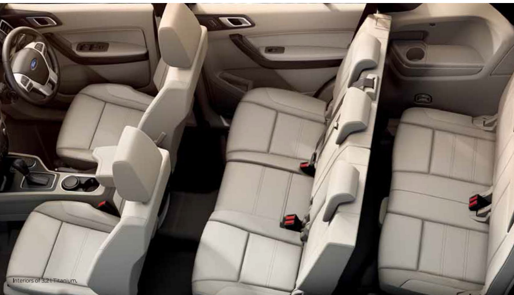
Interiors of 3.2l Titanium.