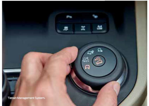
Terrain Management System.