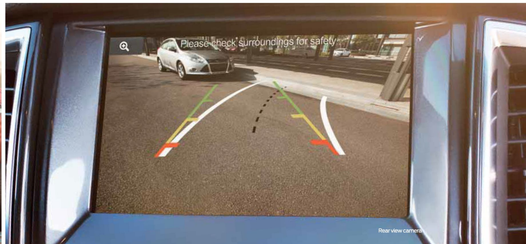
Rear view camera