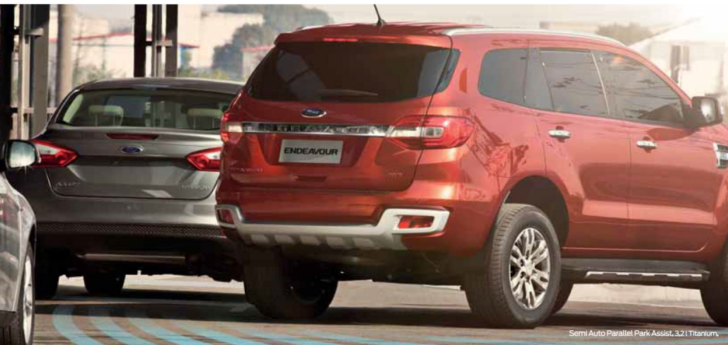
Semi Auto Parallel Park Assist, 3.2i Titanium