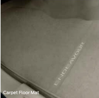
Carpet Floor Mat