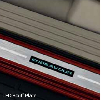
LED Scuff Plate