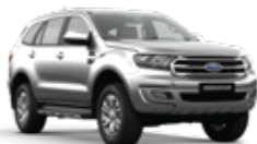
Moon dust Silver