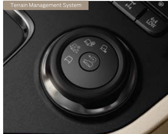
Terrain Management System

Rock - With this mode, keep 4WD in first gear for superior control and tackling rocky terrains.