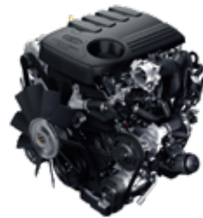
2.2l TDCi DIESEL