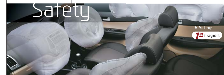
6 Airbags 1 st in segment