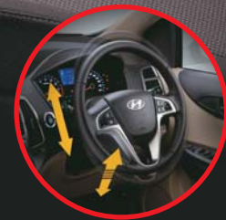
Tilt & Telescopic Steering