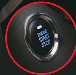
Push Button Start / Stop System