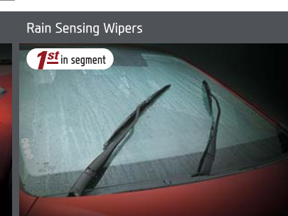
Rain Sensing Wipers 1 st in segment