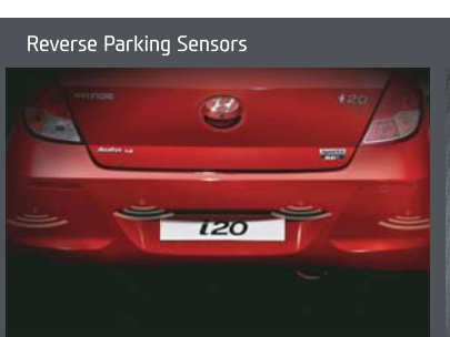
Reverse Parking Sensors