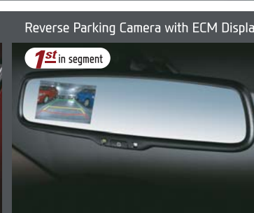
Reverse Parking Camera with ECM Display 1 st in segment