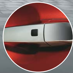
Chrome Door Handles