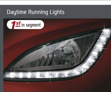
Daytime Running Lights 1 st in segment