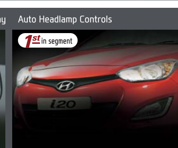
Auto Headlamp Controls 1 st in segment