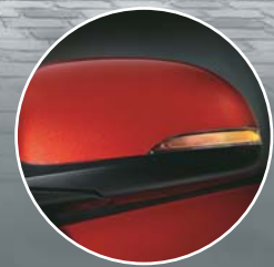
Electric Mirrors with Turn Indicator