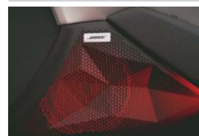
BOSE PREMIUM 8-SPEAKER SOUND SYSTEM

Is a treat for the ears. It will set your mood right for every drive