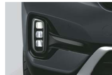
ICE CUBE LED FOG LAMPS

The distinctive shape of the fog lamps enhances its overall sporty looks