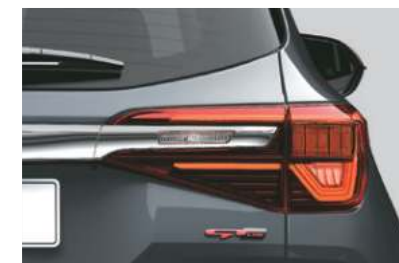
HEARTBEAT LED TAIL LAMPS

The striking design complements the muscular back to give it a premium appearance