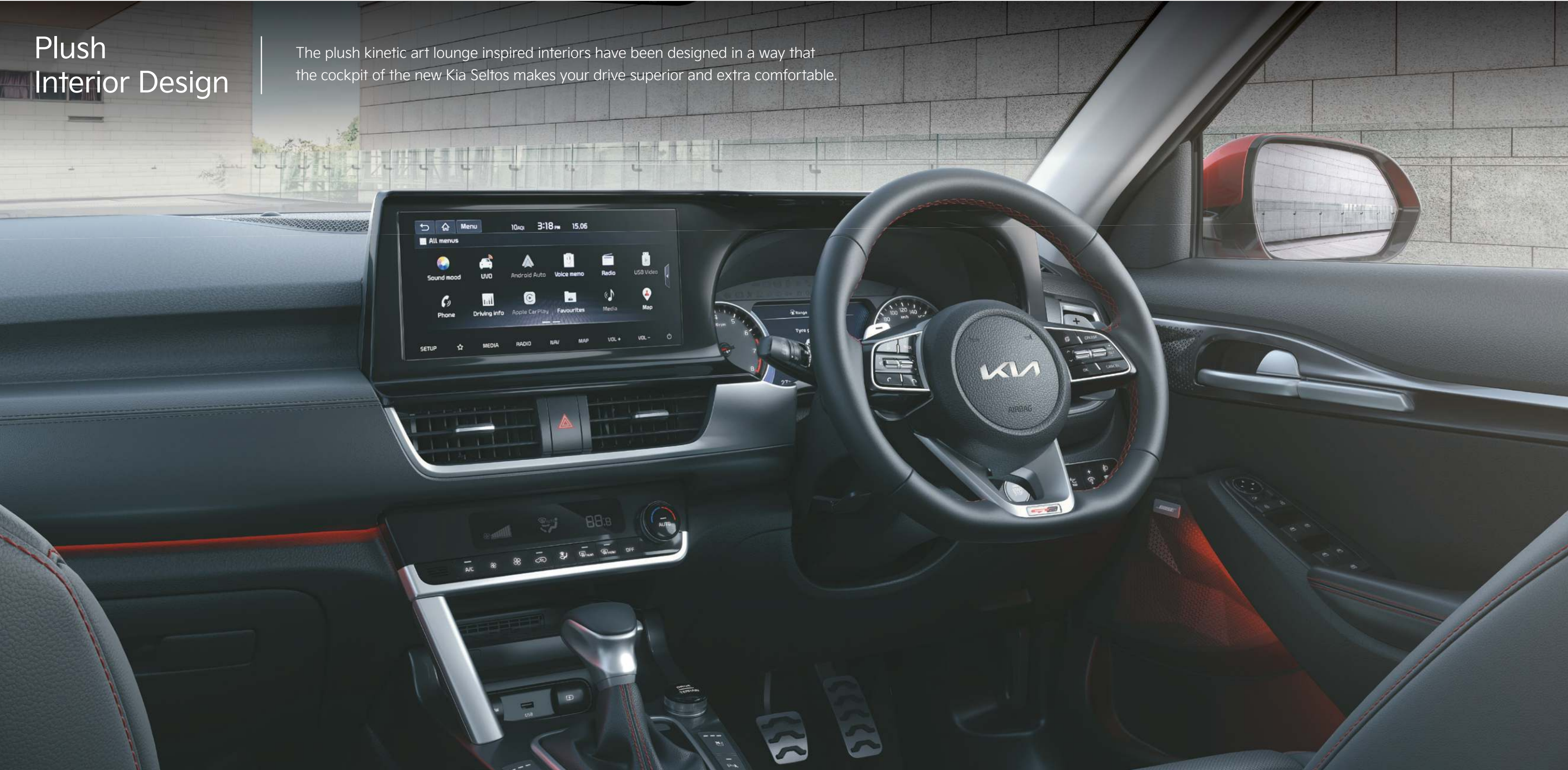
26.03 CM (10.25") ADVANCED HD TOUCHSCREEN NAVIGATION

The plush kinetic art lounge inspired interiors have been designed in a way that the cockpit of the new Kia Seltos makes your drive superior and extra comfortable.