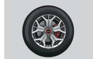
R 17 - 43.18 CM (17") CRYSTAL CUT ALLOY WHEELS WITH FRONT RED CALIPER

Are absolute showstoppers. One glance, and you'll know why