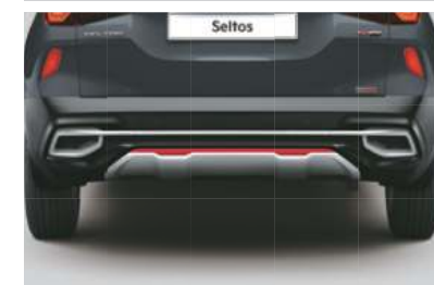
DUAL MUFFLER DESIGN

Adds to the tough looks and provides a strong road presence