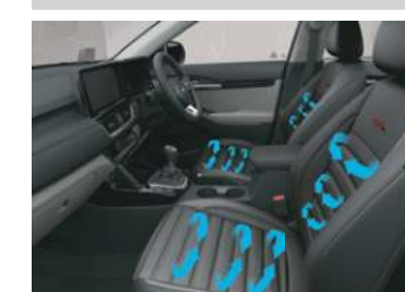
VENTILATED FRONT SEATS

Enhance comfort and convenience, making every drive you take a memorable experience