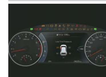
ADVANCED 17.78 CM (7.0") COLOR INSTRUMENT CLUSTER

Displays information which is very easy to read in all light conditions that enhances your overall cabin experience