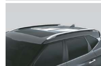
VOICE CONTROLLED SMART SUNROOF

Lets you stay connected to the outside world