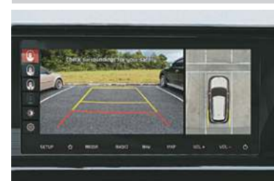
360° CAMERA WITH BLIND VIEW MONITOR

Keeps you aware of your surroundings at all times