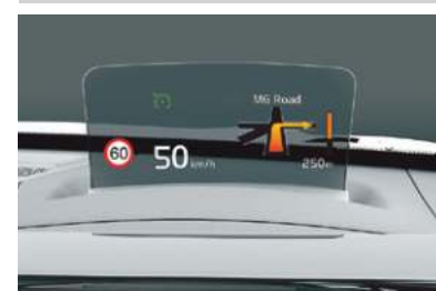
SMART 20.32 CM (8.0") HEAD-UP DISPLAY (HUD)

Makes driving safer by minimizing the movement of driver's line of sight