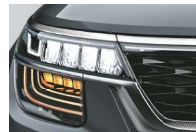
CROWN JEWEL LED HEADLAMPS

Provide a distinctive bold character and better visibility in the dark