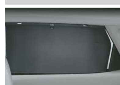
REAR DOOR SUNSHADE CURTAIN

Protects you from direct sunlight for a comfortable journey