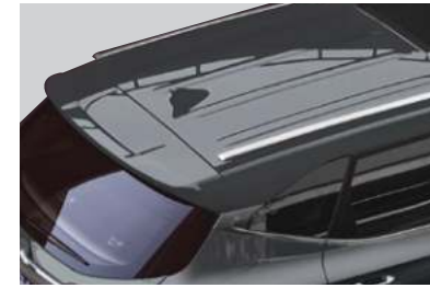
SPORTIER REAR SPOILER AND ROOF RAILS

Give a sporty and dynamic appeal to the badass design