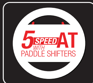
5 SPEED AT WITH PADDLE SHIFTERS