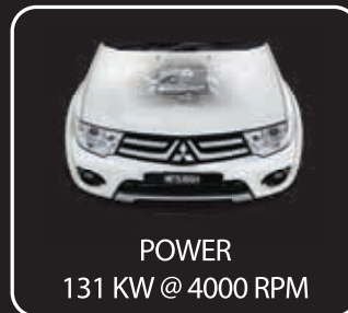
POWER 131 KW @ 4000 RPM