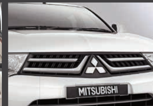
CHROME FRONT GRILLE