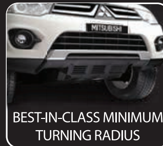
BEST-IN-CLASS MINIMUM TURNING RADIUS