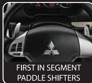
FIRST IN SEGMENT PADDLE SHIFTERS