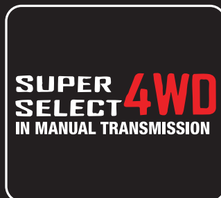
SUPER SELECT 4WD IN MANUAL TRANSMISSION