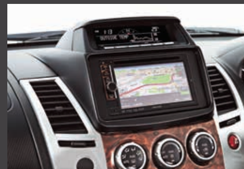
AM/FM RADIO, CD PLAYER, NAVIGATOR WITH CENTRE DISPLAY, TOUCH PANEL AND BLUETOOTH HANDSFREE PHONE INTERFACE