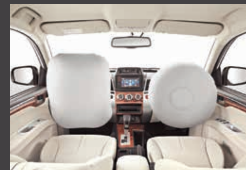
FRONT DUAL AIRBAGS