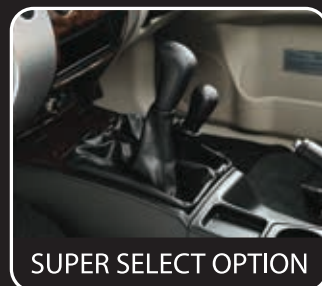
SUPER SELECT OPTION