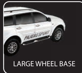
LARGE WHEEL BASE