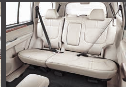
2 ND ROW SEAT ARMREST