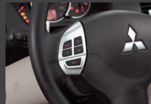
STEERING MOUNT AUDIO CONTROLS