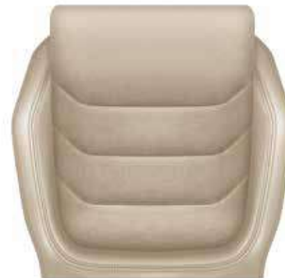
Stone Beige (leather)

*Magnetic Brown and Lava Blue available exclusively in LAURIN & KLEMENT