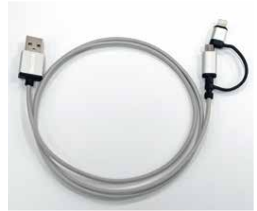
DUAL PORT CABLE