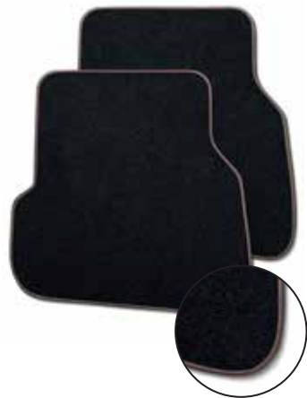
SPORTY RED STITCHING BLACK TEXTILE MATS