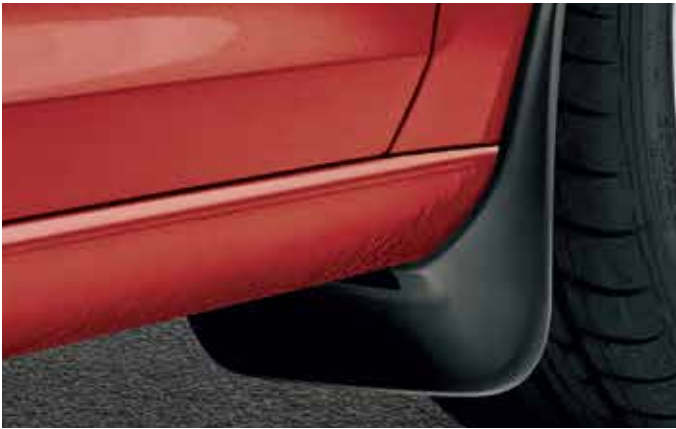
MUD FLAP, SET OF 4 PCS (FRONT AND REAR)