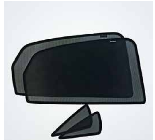
SUNBLINDS, SET OF 4 PCS