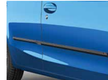
SIDE PROTECTION MOULD