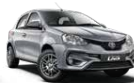
SILVER MICA METALLIC