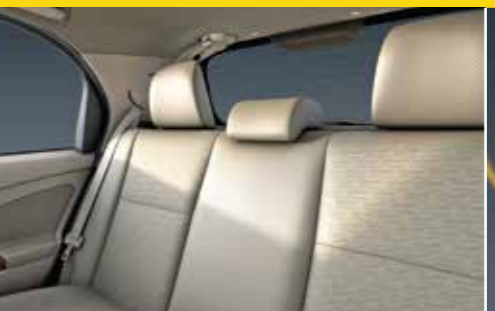
Rear Removable Headrests (All 3 Seats)

Meets international safety standards with a secure, easy-to-fix design for child safety. Available in all variants.