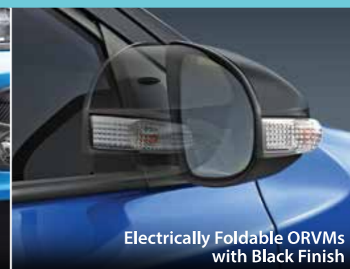
Electrically Foldable ORVMs with Black Finish