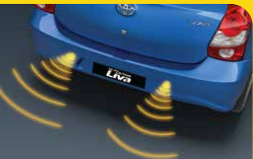
Reverse Parking Sensors

Designed to enhance comfort and reduce injuries in case of a rear-end collision. A standard feature across all variants.