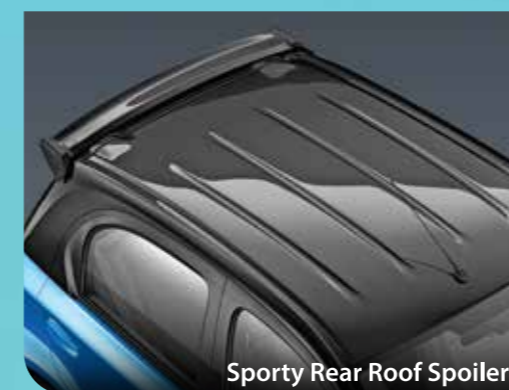
Sporty Rear Roof Spoiler