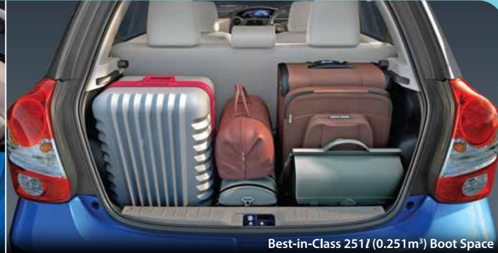
Best-in-Class 251l (0.251m 3 ) Boot Space