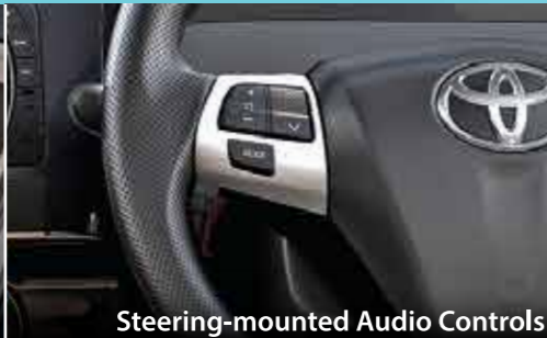
Steering-mounted Audio Controls