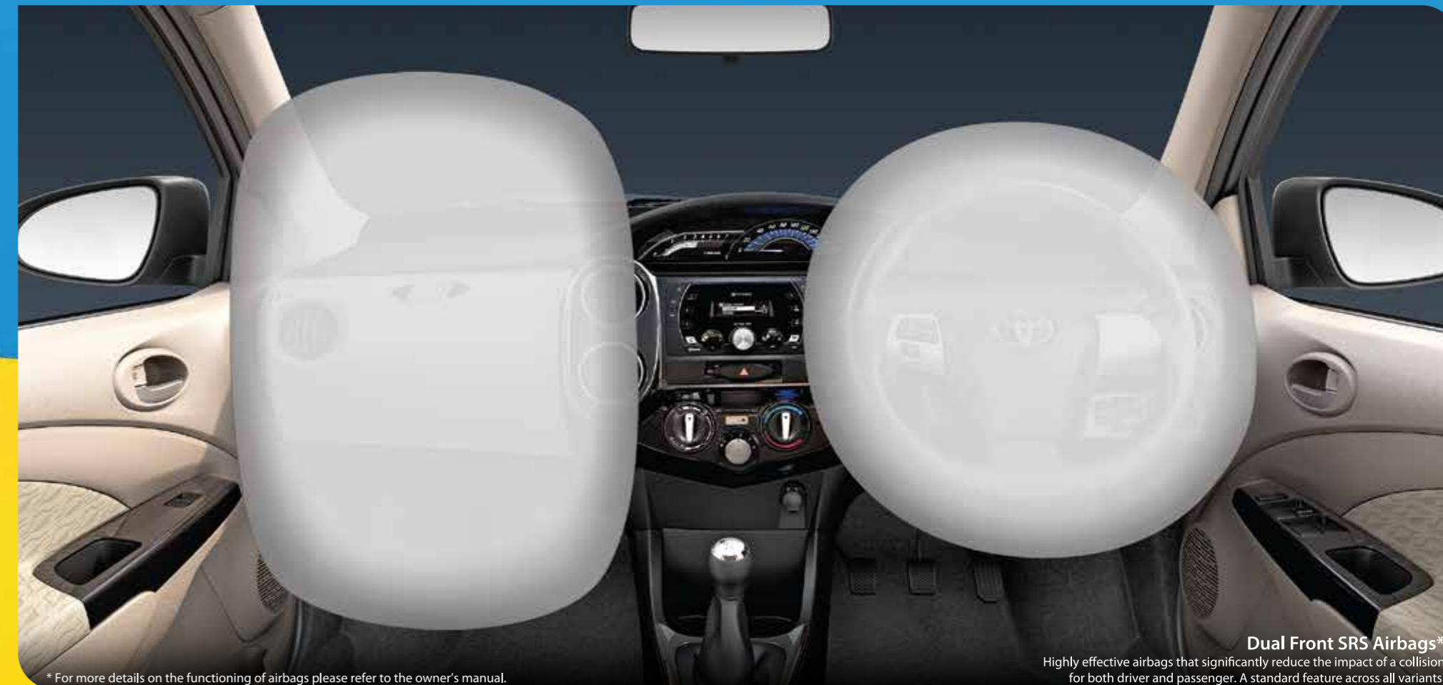
Dual Front SRS Airbags*

Highly effective airbags that significantly reduce the impact of a collision for both driver and passenger. A standard feature across all variants.