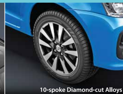
10-spoke Diamond-cut Alloys