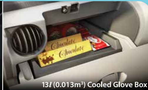
13l (0.013m 3 ) Cooled Glove Box