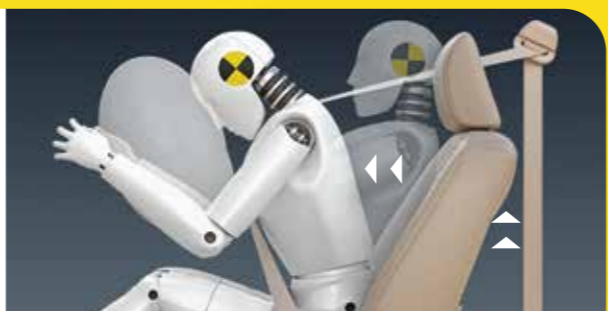
ABS with EBD Front Seat Belts with Pre-tensioner & Force Limiter

ABS suppresses wheel-locking while braking, allowing better manoeuvrability. EBD optimally distributes braking force for better control based on the load conditions.