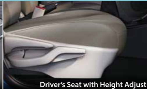
Driver's Seat with Height Adjust