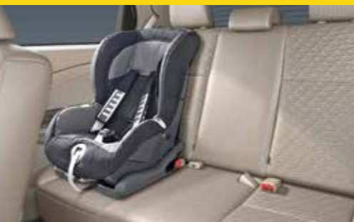
ISOFIX Child Seat Lock

With Emergency Locking Retractors (ELR) that instantly lock occupants safely during abrupt rapid braking.