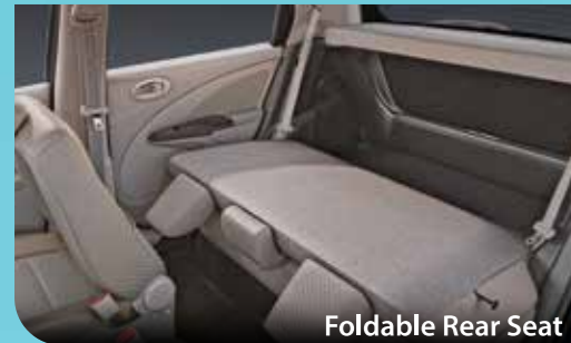
Foldable Rear Seat