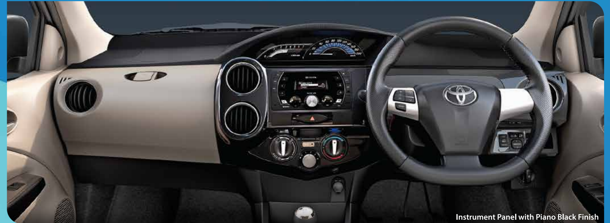
Instrument Panel with Piano Black Finish

Say hello to the trendiest hatch in town! The new Dual-Tone Liva comes with an eye-catching stylish design, and an array of new and exciting features.