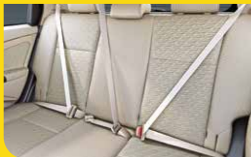
Rear 3-Point Seat Belts (All 3 Seats)

Enhances restraint performance and minimizes impact to the chest in case of a collision. Standardized across all variants.