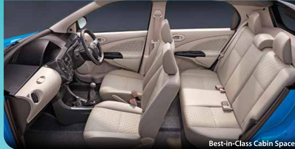
Best-in-Class Cabin Space