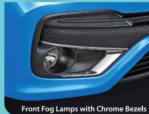
Front Fog Lamps with Chrome Bezels

Discover style that makes sense only with the new Dual-Tone Liva. Get features that offer unmatched safety, comfort and quality, in an attractive new dual-tone design and an exciting new look. The new Dual-Tone Liva's painted roof contrast is a direct factory build. A first in this segment.