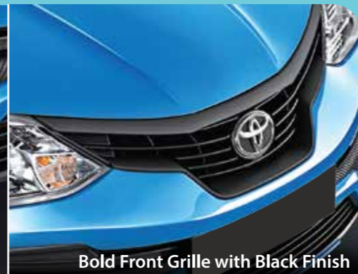
Bold Front Grille with Black Finish