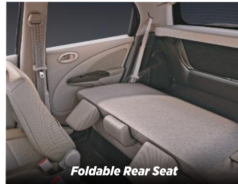
Foldable Rear Seat