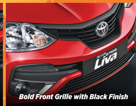
Bold Front Grille with Black Finish