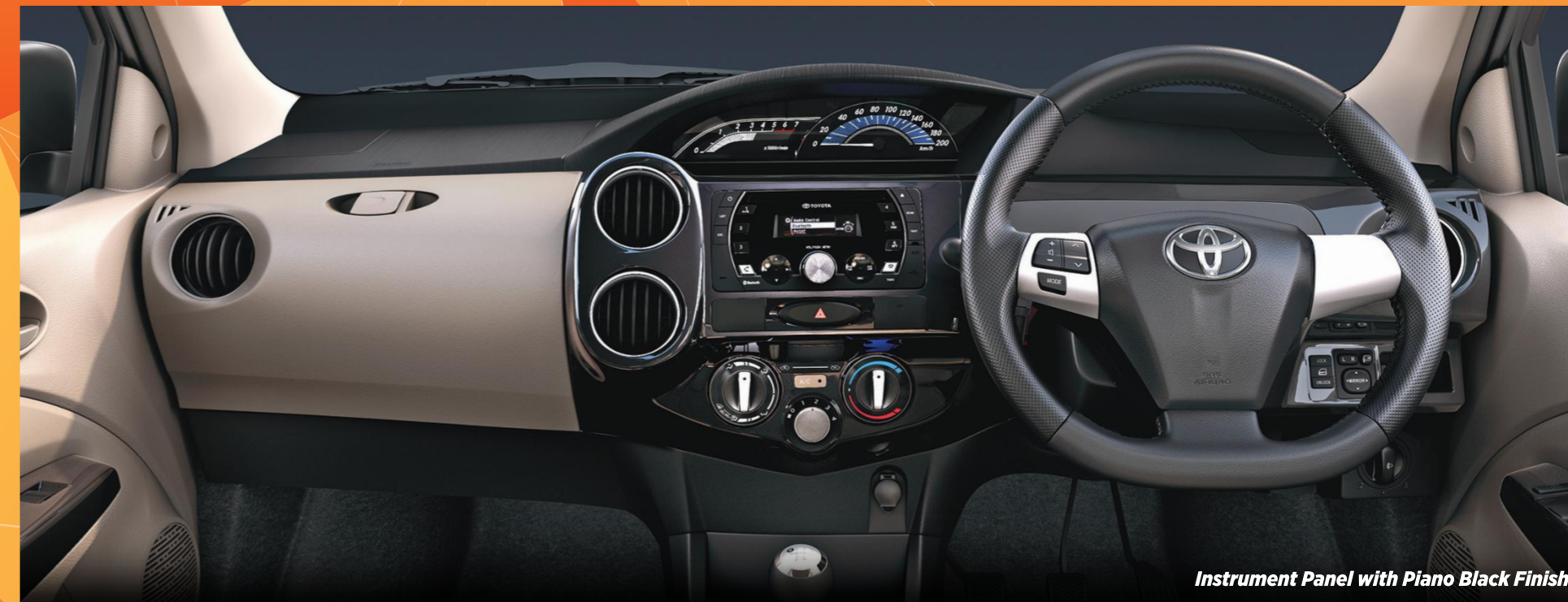
Instrument Panel with Piano Black Finish

Discover style that makes sense only with the new Dual-Tone Liva. Get features that offer unmatched safety, comfort and quality, in an attractive new dual-tone design and an exciting new look. The new Dual-Tone Liva's painted roof contrast is a direct factory build. A first in this segment.