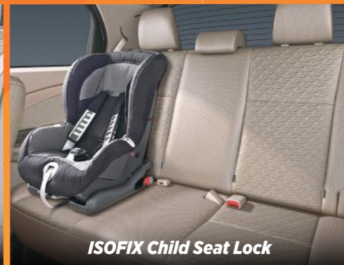
ISOFIX Child Seat Lock

With Emergency Locking Retractors (ELR) that instantly lock occupants safely during abrupt rapid braking.