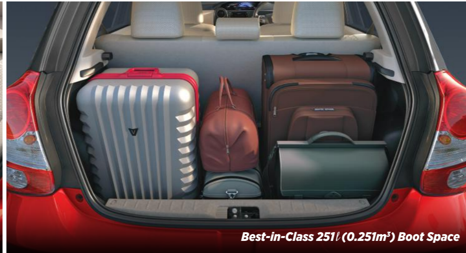
Best-in-Class 251ℓ (0.251m 3 ) Boot Space