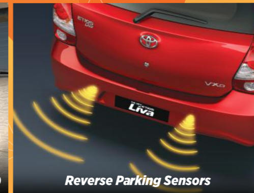
Reverse Parking Sensors

Designed to enhance comfort and reduce injuries in case of a rear-end collision. A standard feature across all variants.