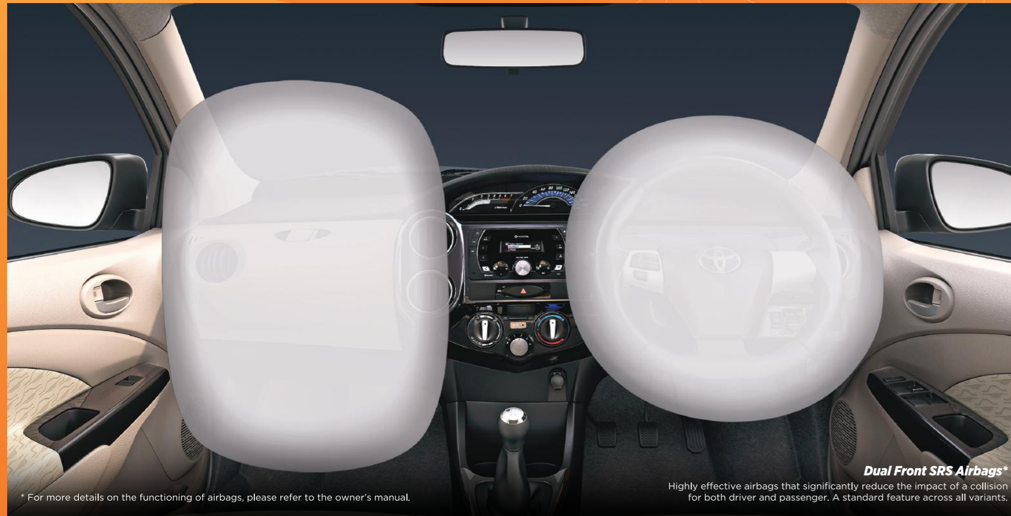
Dual Front SRS Airbags*

Highly effective airbags that significantly reduce the impact of a collision for both driver and passenger. A standard feature across all variants.