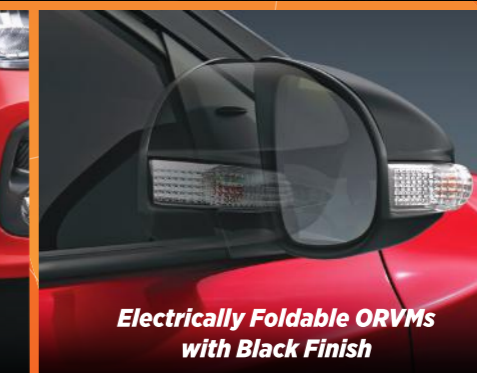
Electrically Foldable ORVMs with Black Finish