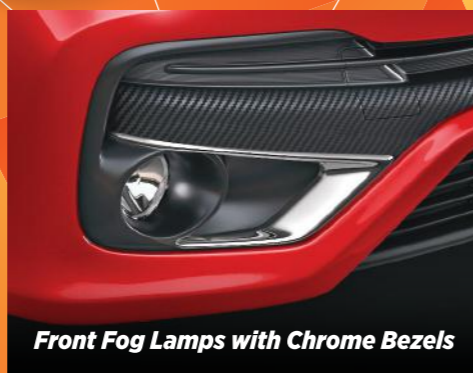
Front Fog Lamps with Chrome Bezels