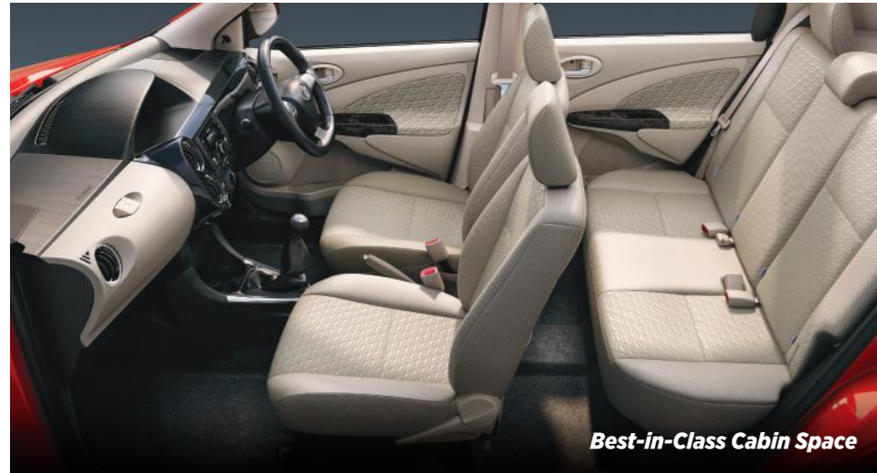
Best-in-Class Cabin Space