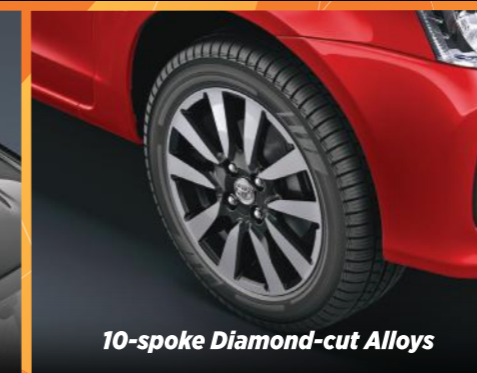
10-spoke Diamond-cut Alloys