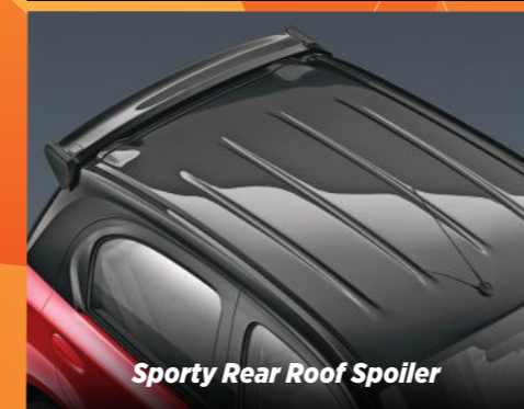
Sporty Rear Roof Spoiler