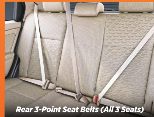
Rear 3-Point Seat Belts (All 3 Seats)

* For more details on the functioning of airbags, please refer to the owner's manual.