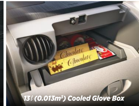
13ℓ (0.013m 3 ) Cooled Glove Box