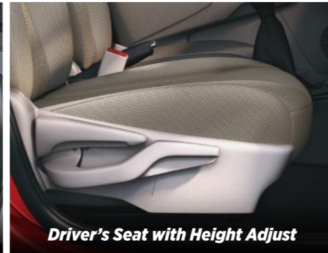
Driver's Seat with Height Adjust