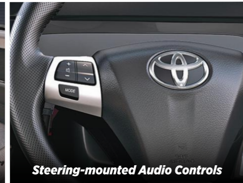
Steering-mounted Audio Controls