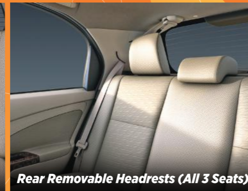
Rear Removable Headrests (All 3 Seats)

Meets international safety standards with a secure, easy-to-fix design for child safety. Available in all variants.