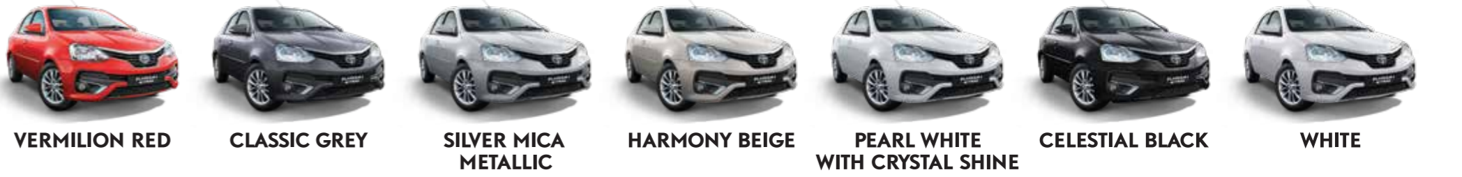
VERMILION RED CLASSIC GREY SILVER MICA METALLIC HARMONY BEIGE PEARL WHITE WITH CRYSTAL SHINE CELESTIAL BLACK WHITE