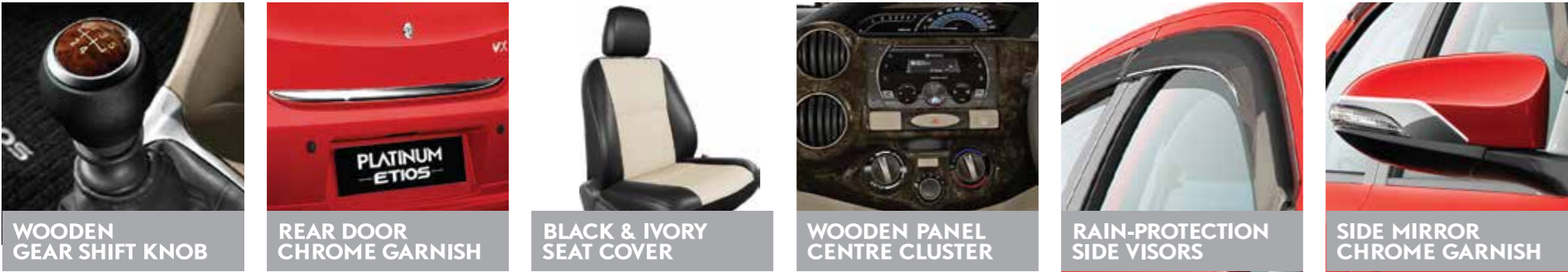
WOODEN GEAR SHIFT KNOB REAR DOOR CHROME GARNISH BLACK & IVORY SEAT COVER WOODEN PANEL CENTRE CLUSTER RAIN-PROTECTION SIDE VISORS SIDE MIRROR CHROME GARNISH REAR DOOR CHROME GARNISH