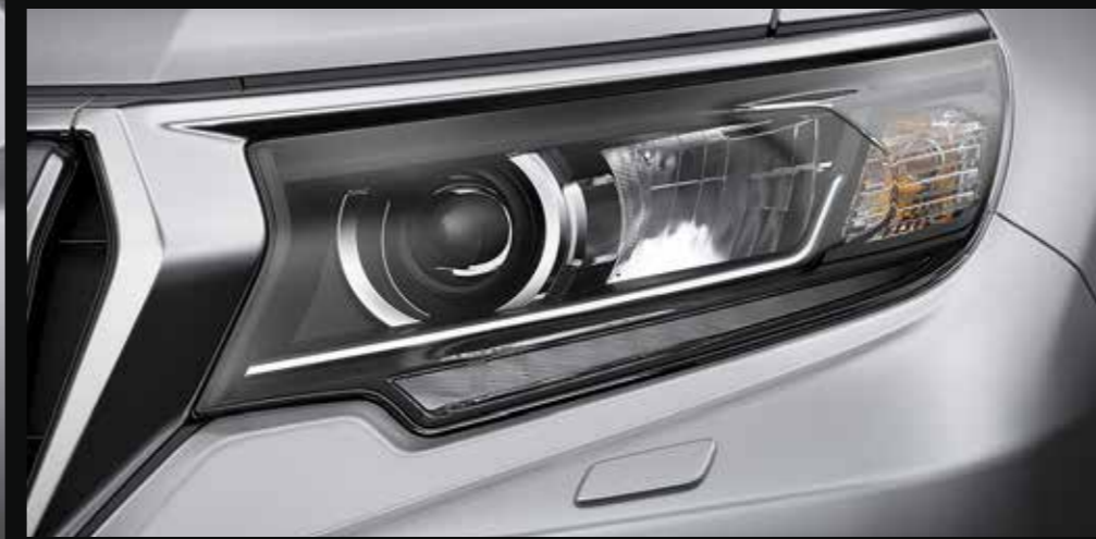
Projector-type Full LED Auto Headlamps with Headlamp Washer