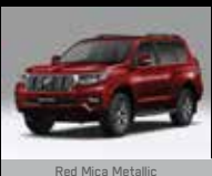
Red Mica Metallic