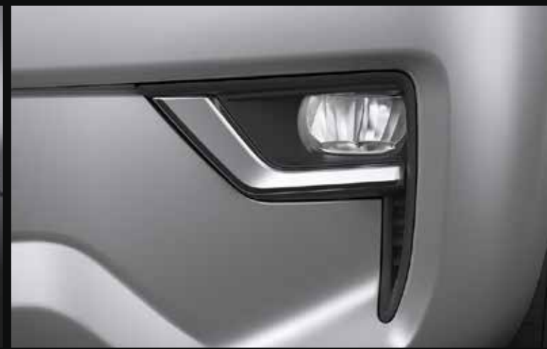
LED Fog lamps