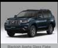
Blackish Ageha Glass Flake