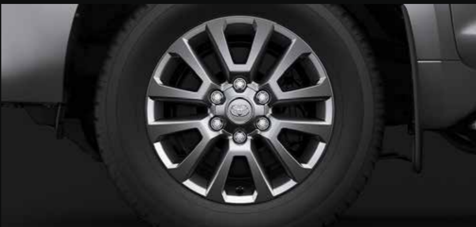
18" Alloy Wheels [6-double-spoke]

Each and every aspect of the design philosophy behind the new edition stays true to the tough as nails image while pursuing a marked evolution to sport a more advanced image. The bonnet has been redesigned to improve downward visibility at the centre while the headlamps and grille cooling openings have been moved higher to enhance protection and offer increased wading depth.