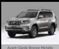
Avant-Garde Bronze Metallic