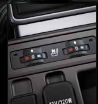
Heated and Ventilated Seats

Materials other than genuine leather are also used in upholstery