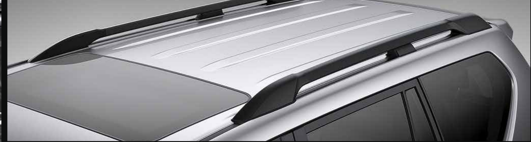
Moon Roof [Electric Tilt & Slide] with Roof Rails