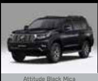
Attitude Black Mica