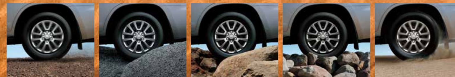
■ ROCK & DIRT