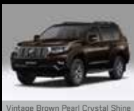
Vintage Brown Pearl Crystal Shine