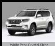
White Pearl Crystal Shine

*Materials other than genuine leather are also applicable in upholstery