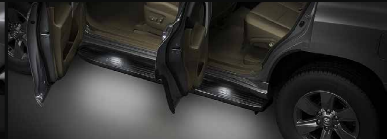
Illuminated Entry System