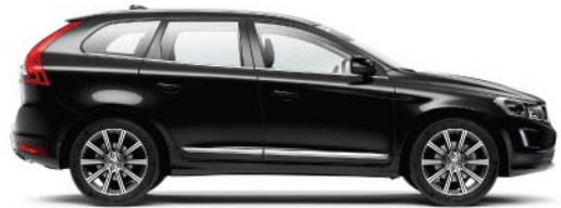
Black Sapphire Metallic