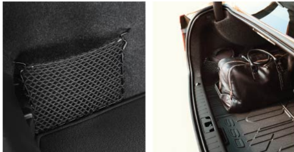
Load Compartment Net Pocket