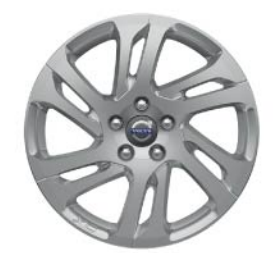
Valder, 7.5x17" Silver