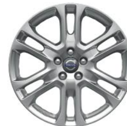
Pan, 7.5x18" Silver Bright