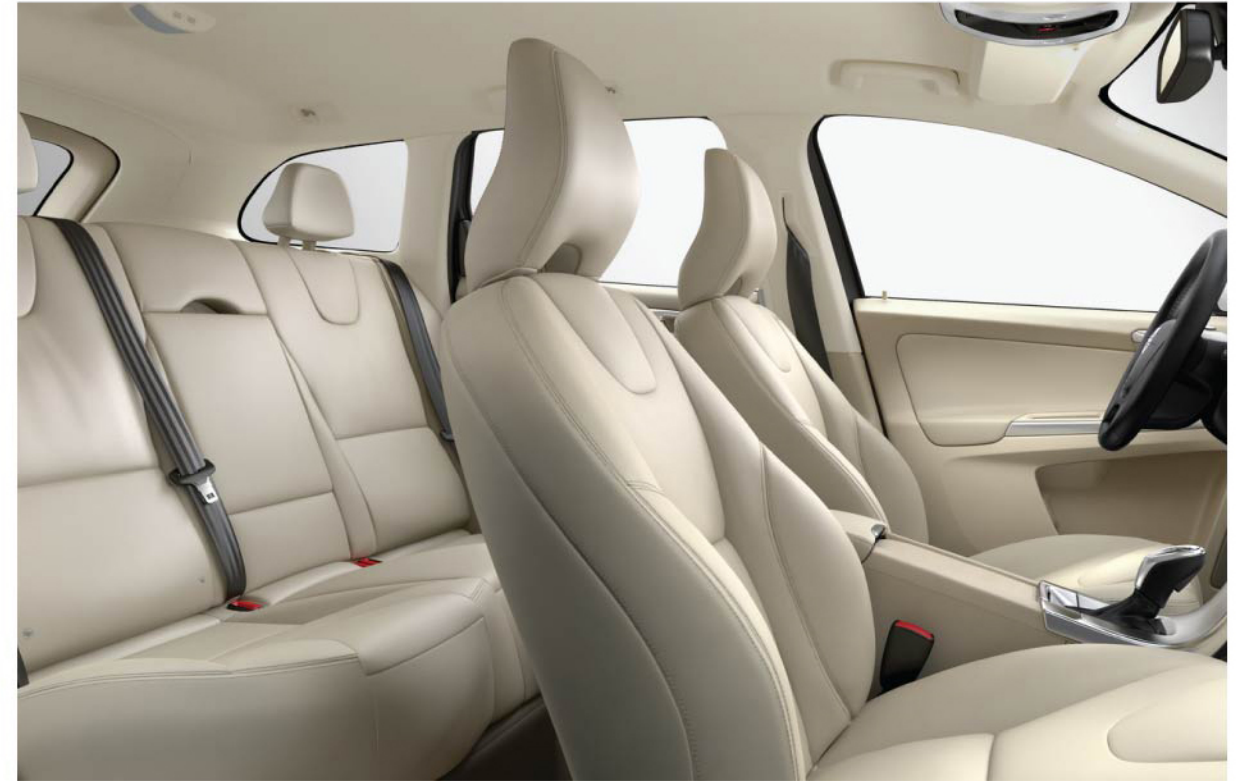
G312 Soft Beige/Beech Wood in Beige Interior with Soft Beige Headlining