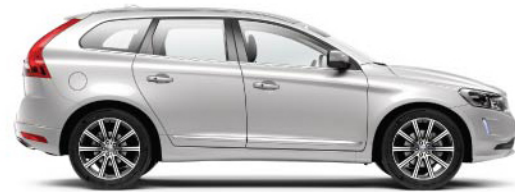
Bright Silver Metallic