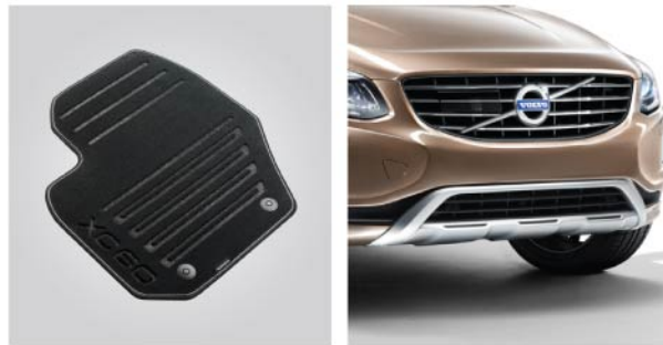
Passenger Floor Mat - Rubber