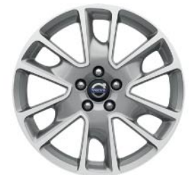
Freja, 8x18" Diamond Cut/Light Light Grey