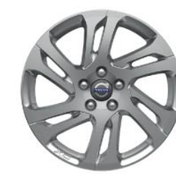
Valder, 7.5x17" Diamond Cut/Silver Bright