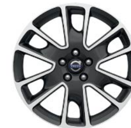
Freja, 8x18" Diamond Cut/Matte Dark Grey