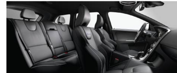
G161 Offblack in Black Interior with Charcoal Headlining