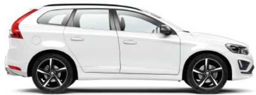
Crystal White Pearl