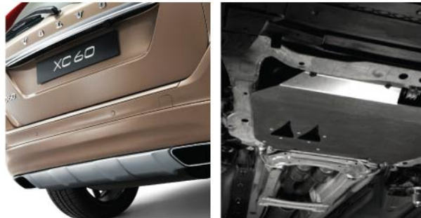
Skid Plate Rear