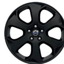
Merac 7.5x18" Glossy Black