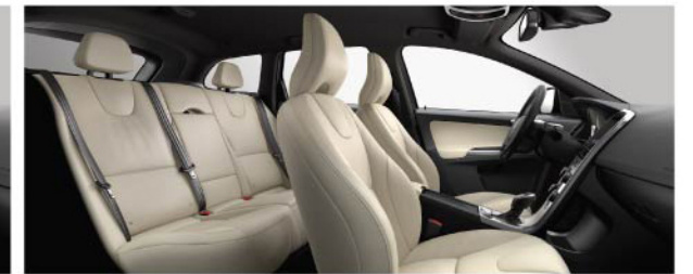
G16B Soft Beige in Black Interior with Charcoal Headlining