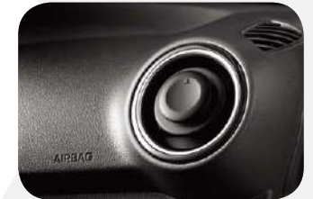
360° rotatable air ducts