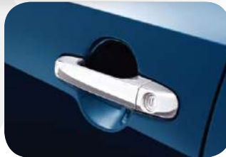
Chrome outside door handles