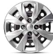
14-inch Steel Wheel