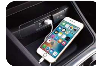
AUX & USB connection with 2-stage tray