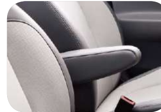
Driver's seat armrest