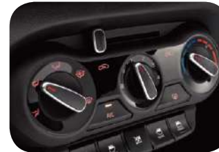
Manual temperature control