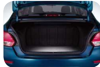
Illuminated luggage compartment (475 L)