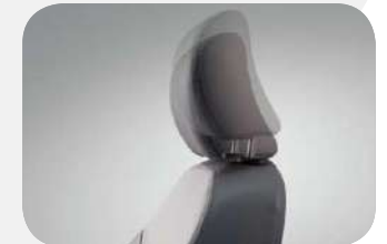
Height adjustable front seat headrest