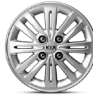
14-inch Alloy Wheel