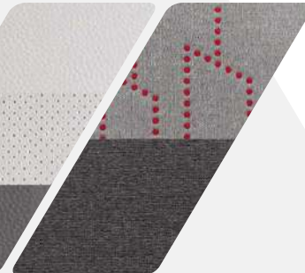
Gray Two-tone Leather