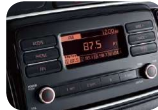
3.8-inch audio display