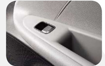
Rear door power windows