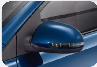
Electric adjustable outside mirrors with LED side repeaters