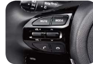
Audio remote control