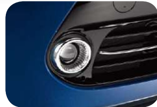
Projection fog lamps