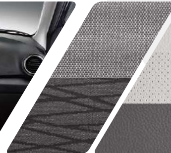
Gray Two-tone Cloth