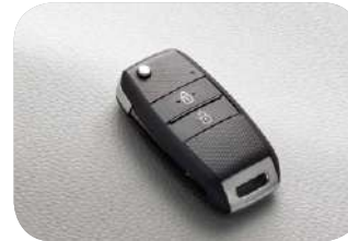
Folding remote key fob