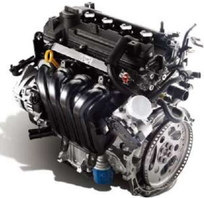
1.4 MPI Gasoline Engine Max. power: 95 ps / 6,000 rpm Max. torque: 13.5 kg-m / 4,000 rpm