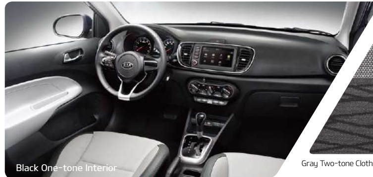
Black One-tone Interior