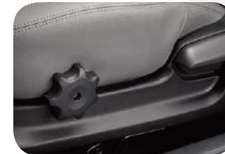
Driver's seat cushion tilt adjuster