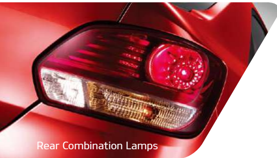
Rear Combination Lamps