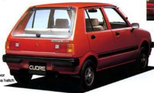
5-Door Glass hatch