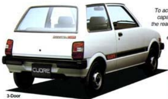
3-Door Full open hatch

To accommodate various size loads, the Cuore displays remarkable capacity. The full (roof to floor) hatchback door makes loading from the rear easy on the 3-door model, and a convenient glass hatchback door on the 5-door model also provides loading ease and excellent visibility. A special feature is the versatile split forward folding rear seat. The front passenger seat also folds down, for times when you need to carry an extra-long load.