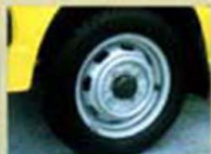
• 12" radial tires