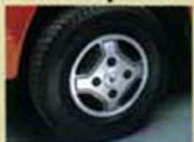
• 10" radial tires & aluminum wheels (except on ECE & EEC (RHD model))