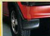
• Rear mudguards

Please check with your dealer as to standard and optional equipment.