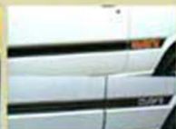
• Stripe for 3-door model • Stripe for 5-door model