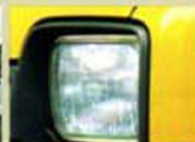
• Foglamp headlights