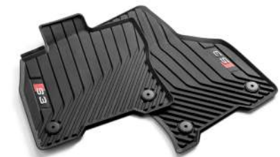
Sport Floor Mats