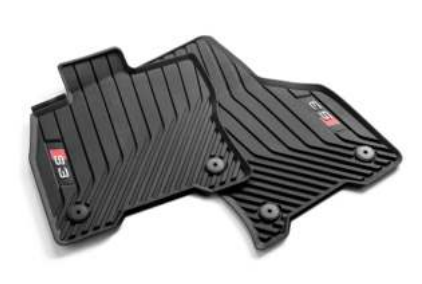
Sport Floor Mats