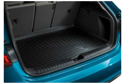
Luggage Compartment Liner