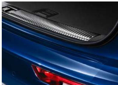
Loading Sill Protective Foil