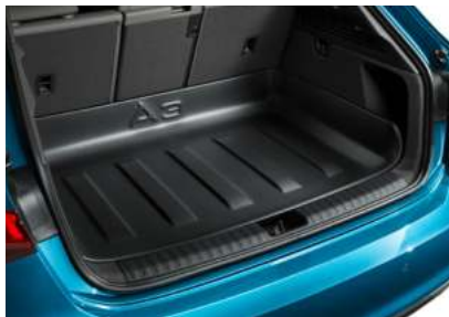
Rigid Load Liner