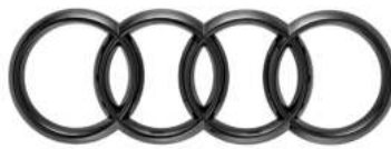
Black Badges and Rings