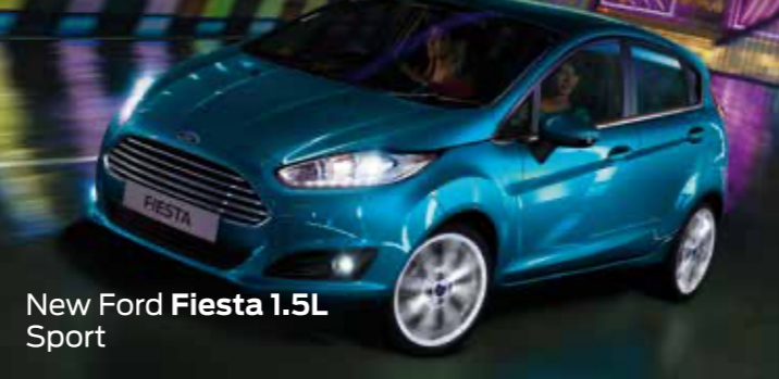
New Ford Fiesta 1.5L Sport

Indulge your sense of style Do you love great style and design? Then you'll love the new Ford FIESTA. Hip and fashionable colours show off its eye-catching new design to perfection. Inside, the design is refined yet very cool, with stylish detailing and smart technology.