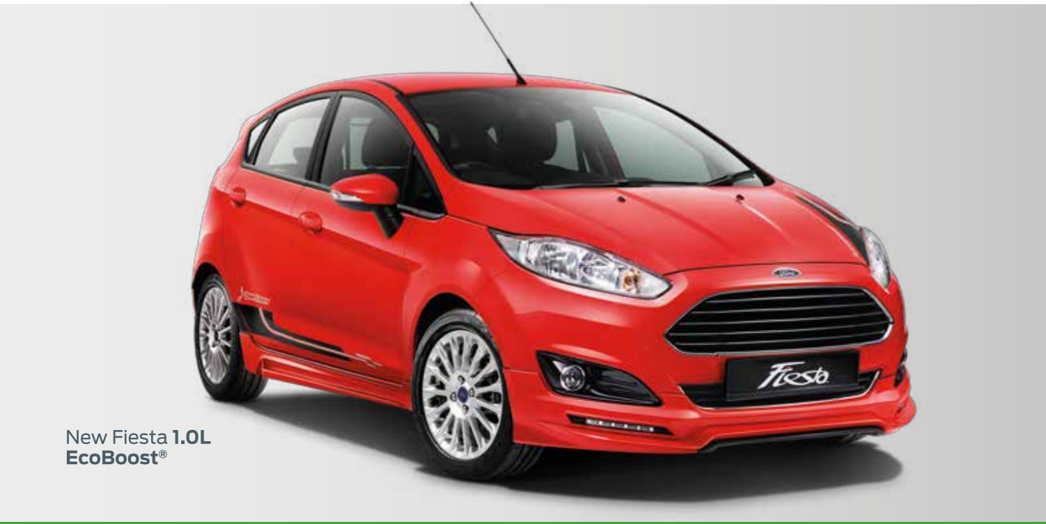
New Fiesta 1.0L EcoBoost®

Rain Sensing Wipers Automatically clearing your vision before you even realized it has started to rain.