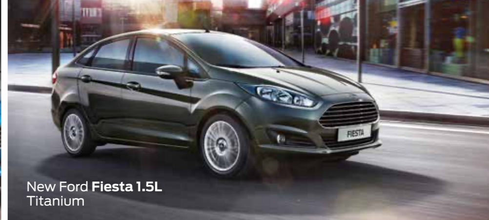
New Ford Fiesta 1.5L Titanium