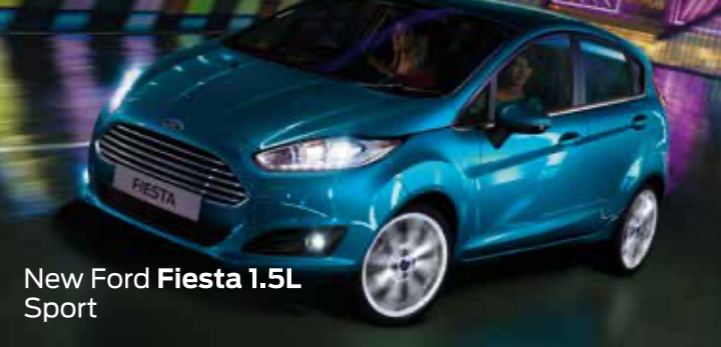
New Ford Fiesta 1.5L Sport

Do you love great style and design? Then you'll love the new Ford FIESTA . Hip and fashionable colours show off its eye-catching new design to perfection. Inside, the design is refined yet very cool, with stylish detailing and smart technology.