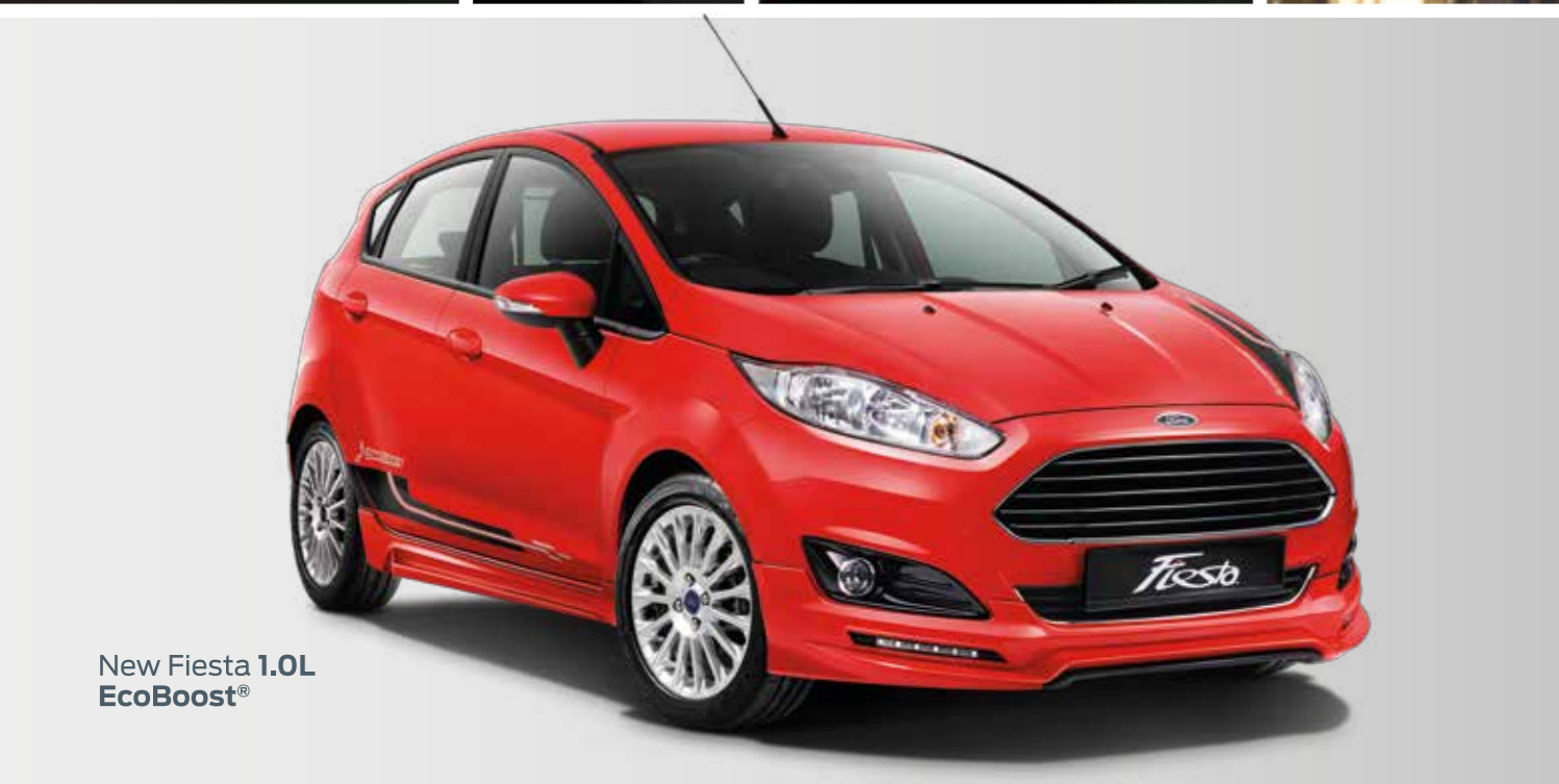
New Fiesta 1.0L EcoBoost®

Automatically clearing your vision before you even realized it has started to rain.