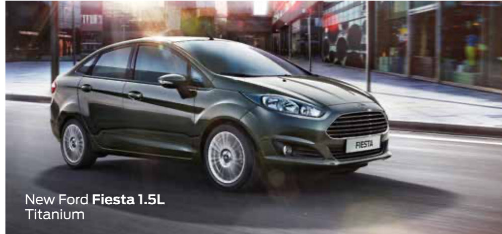
New Ford Fiesta 1.5L Titanium