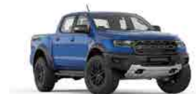
Ford Performance Blue