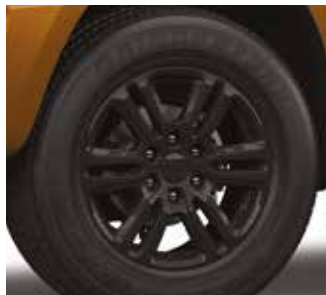
Black Alloy Wheels