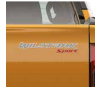
WildTrak Sport Emblem