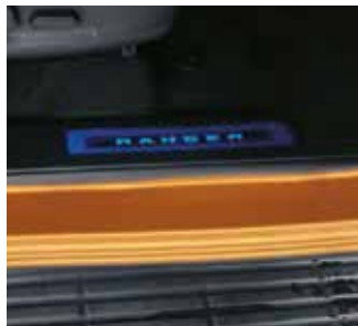
Illuminated Front Scuff Plate