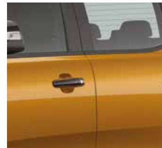
Black Door Handles