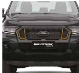
New Front Grille