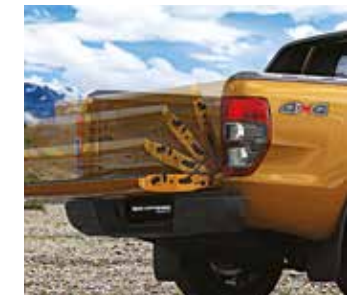
Easy Lift Tailgate