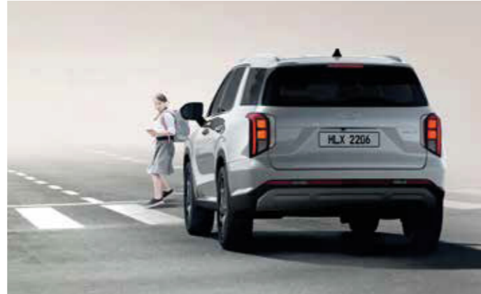
Forward Collision-Avoidance Assist (FCA) If the preceding vehicle suddenly slow down, or if a forward collision risk is detected, such as a stopped vehicle, a pedestrian or a cyclist in front, it provides a warning. After the warning, if the risk of collision increases, it automatically assists with emergency braking.