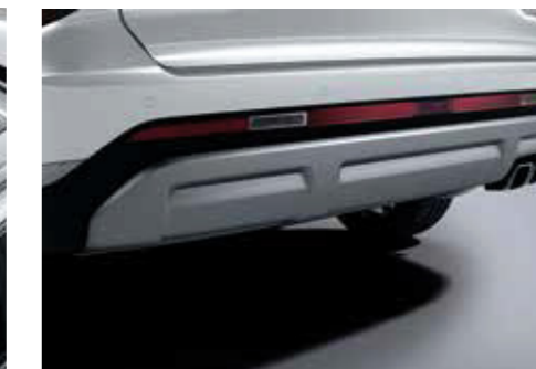
Rear fog lamps