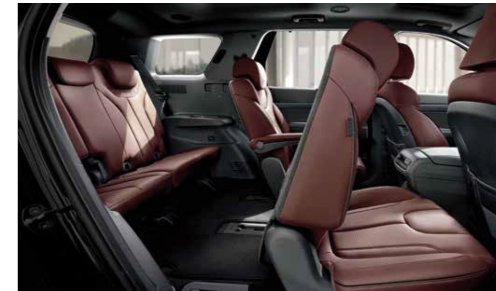
Smart one-touch walk-in button

Seat adjustment mechanisms are designed for one-touch convenience. The second-row seats slide forward at the press of a button, making entry and exit easier for third-row passengers.