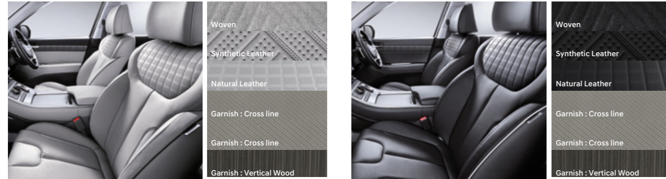
CoolGrey Two-tone Interior