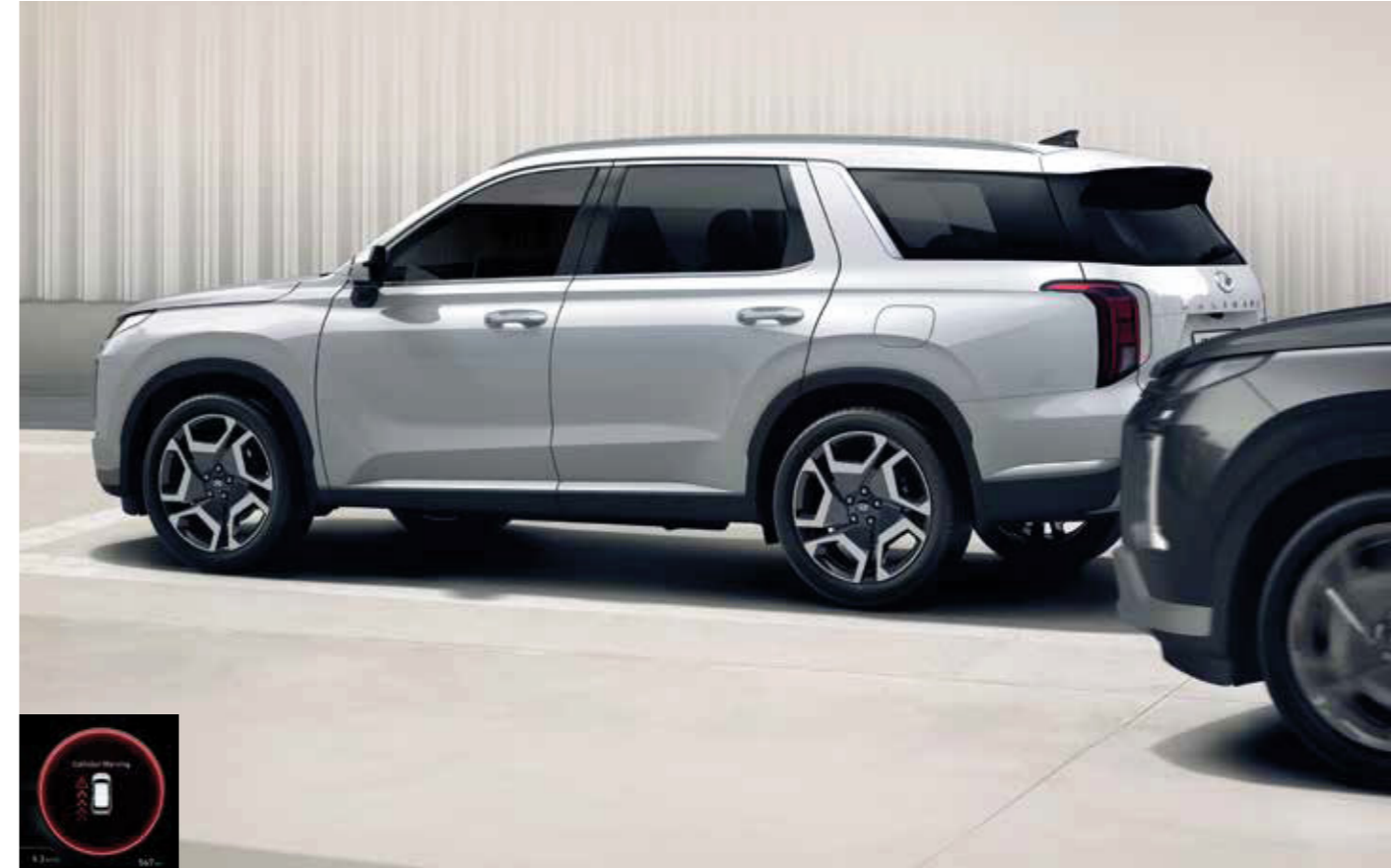
Safe Exit Assist (SEA) When the occupant open the door to exit the vehicle after a stop, if an approaching vehicle from the rear side is detected, it provides a warning. It also helps keep the rear door closed through operation of the electronic child lock.