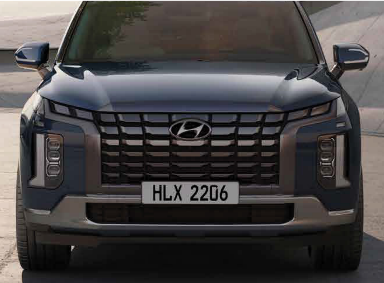
Full LED headlamps / Dark chrome radiator grille

From any angle, PALISADE projects the look of authority. From the bold grille to the futuristic design of the alloy wheels, every detail conveys a premium look and feel. The uniquely configured Daytime Running Lights add extra emphasis to the wide, stable stance. For stylistic unity and harmony, rear combination lamps mirror the design of the front LEDs.