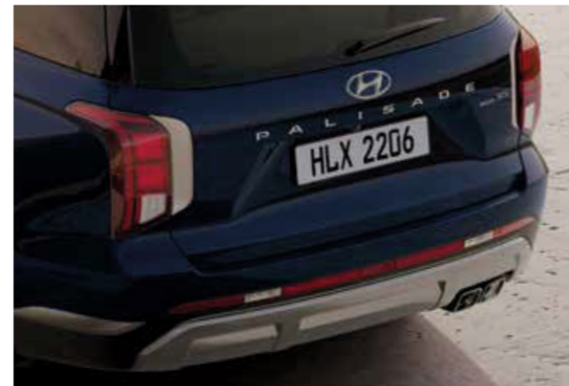
LED rear combination lamps