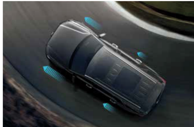
HTRAC HTRAC All-Wheel Drive & Multi Terrain Control

* Features and specifications may vary by market. Please consult your local dealer.