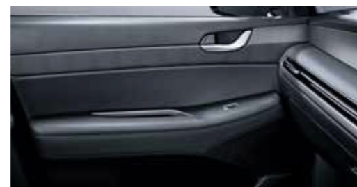
Leatherette door armrest