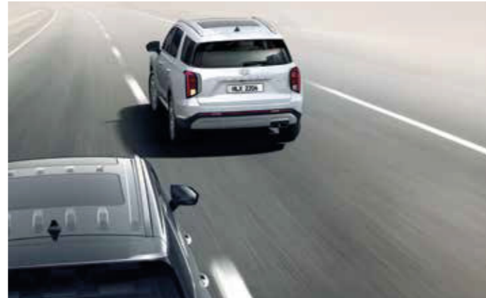
Blind Spot Collision Warning (BCW) When operating the turn signal switch to change lanes, if there is a risk of collision with a rear side vehicle, it provides a warning. If exiting a parallel parking spot and there is a risk of collision with a rear side vehicle, it automatically assists with emergency braking.