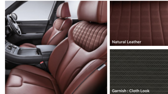
Burgundy Color Package Interior