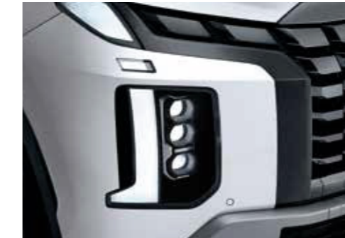
Full LED headlamps