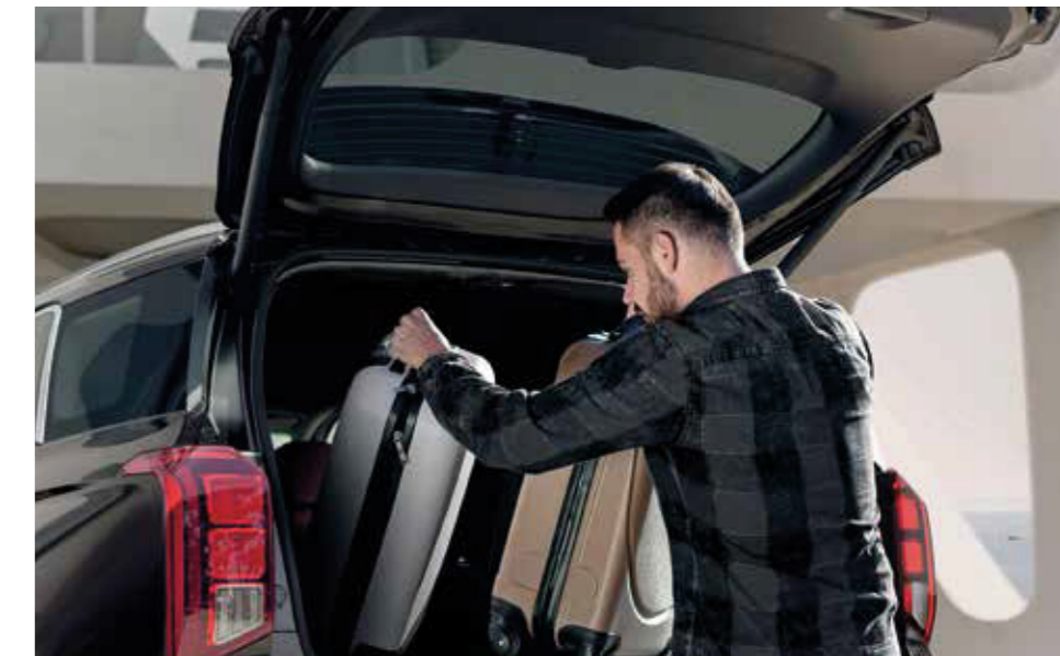
Smart power tailgate