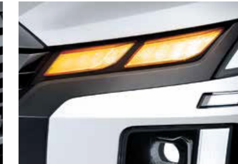
Hidden lighting turn signal lamp