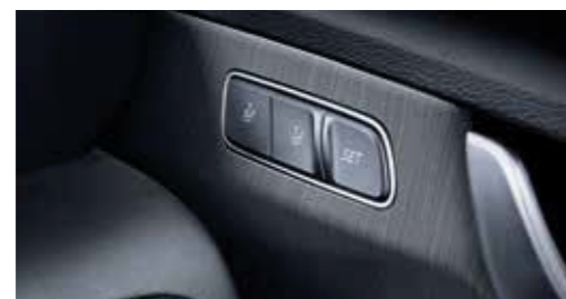
Integrated Memory System