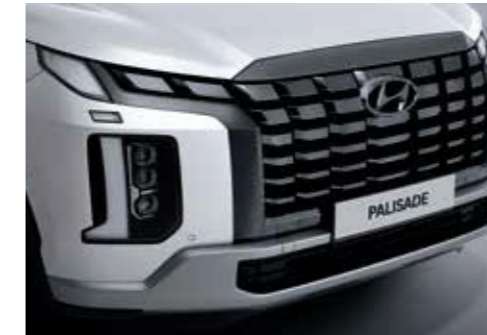
Dark chrome radiator grille

There's a busy day ahead: school runs, fitness club, lunch with friends and shopping. When there's so much to do and so little time to do it, Palisade helps you get it all done and in high style. Safety, comfort and convenience features are all well-thought-out and take much of the stress out of driving. Palisade lets you relax, focus on the important things and makes life a whole lot easier.