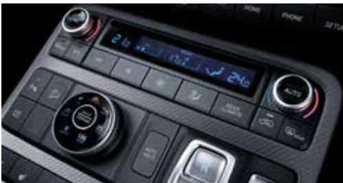
Full auto air conditioning system