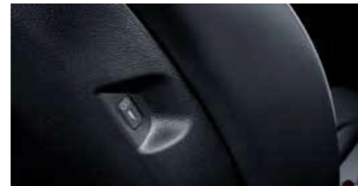
USB charging ports