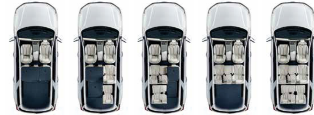
2nd and 3rd row folded 3rd row folded and 2nd row folded 60% 3rd row folded and 2nd row folded 40% 3rd row folded 8-seater

Seat adjustment mechanisms are designed for one-touch convenience. The second-row seats slide forward at the press of a button, making entry and exit easier for third-row passengers.