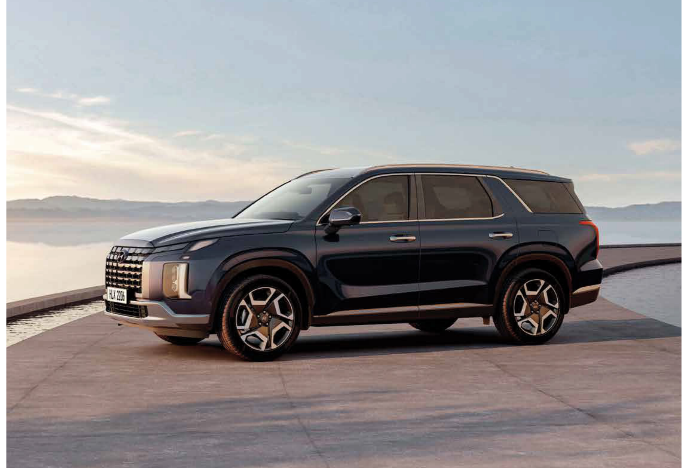
Pictures are for illustration purposes only. Actual units may differ. Terms & conditions apply.