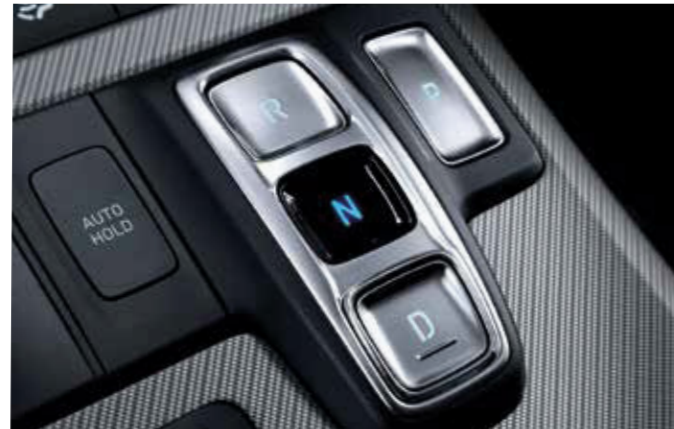
8-speed shift-by-wire automatic transmission

Pictures are for illustration purposes only. Actual units may differ. Terms & conditions apply.