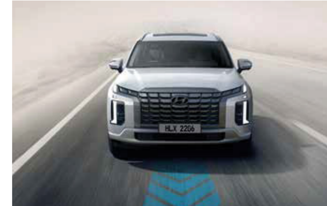
Lane Following Assist (LFA) Lane Following Assist helps center the vehicle in the lane.