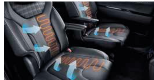
Ventilated & heated 1st & 2nd seats