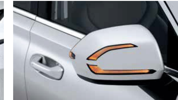
LED outside mirror repeaters