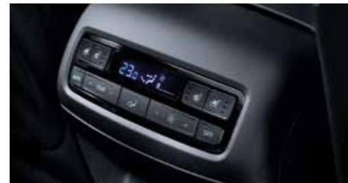
Three-zone, independent-control, fully automatic air conditioning