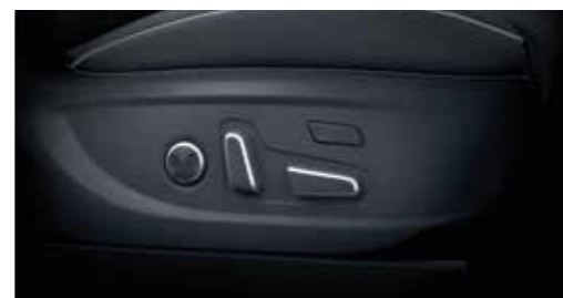
Memory Driver Seat 12-Way (with Cusion Extension & Lumbar Support)