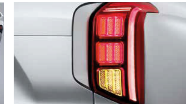
Full LED rear combination lamps