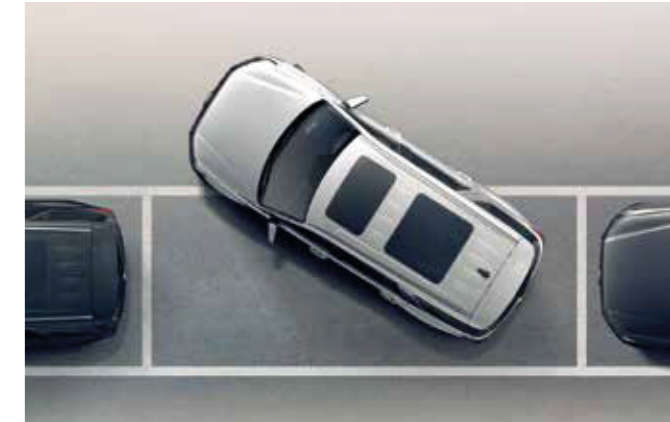
Parking Distance Warning (PDW) Parking Distance Warning warns against collisions with objects around the vehicle at low speeds.