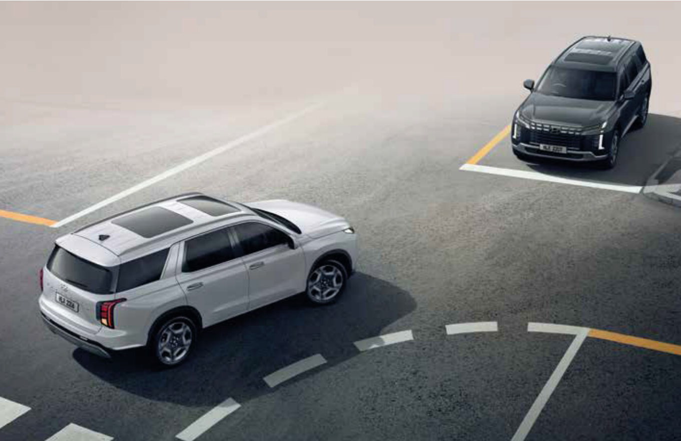
Forward Collision-Avoidance Assist (FCA, Junction Turning) While driving if there is a risk of collision with an oncoming vehicle while turning right at an intersection, it automatically assist with emergency braking.

With Hyundai SmartSense™, our cutting-edge Advanced Driver Assistance Systems, Palisade is equipped with the latest active safety technologies built to provide you with more safety and peace of mind.