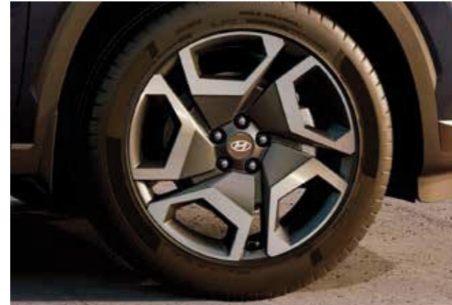
20" Alloy wheels