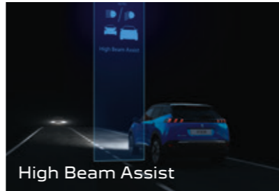
High Beam Assist

Comfort and safety in the all-new PEUGEOT 2008 are enhanced further with the numerous latest-generation driving assistance systems such as High Beam Assist, Blind Spot Monitoring, Active Lane Keeping Assist, Active Safety Brake, and Driver Attention Warning.