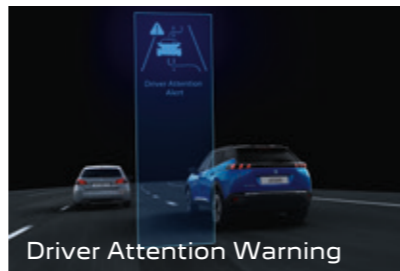
Driver Attention Warning