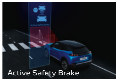
Active Safety Brake