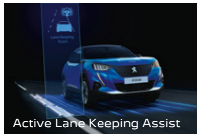
Active Lane Keeping Assist