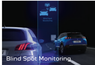
Blind Spot Monitoring