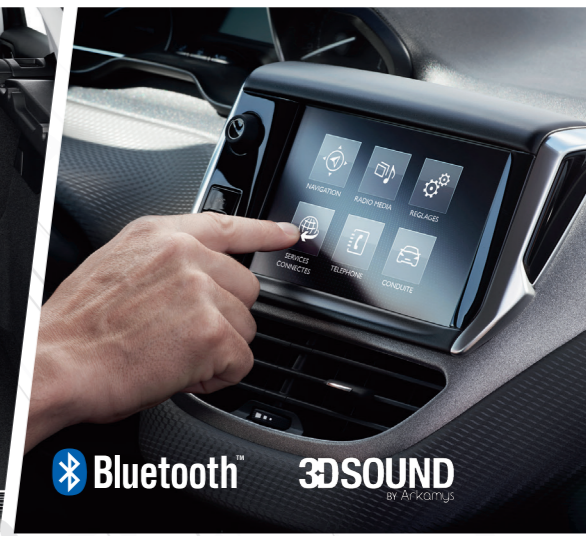
7" multifunction touchscreen