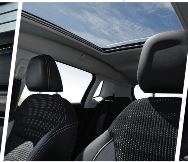
Panoramic roof with mood lighting & electric sunblind