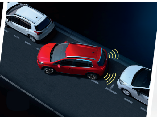
Peugeot Park Assist (Reverse)