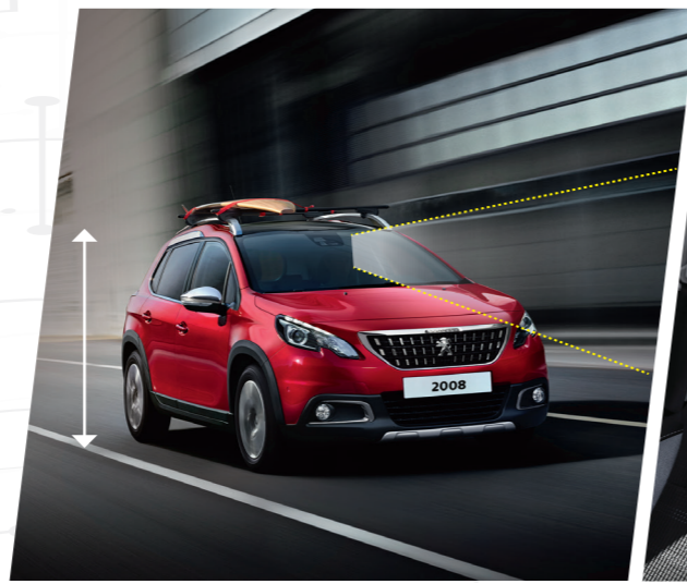
High ground clearance + High driving position

Peugeot's all-new PureTech engines power the new 2008 SUV Puretech, culminating in a driving experience that is exciting, economical and thoroughly rewarding.