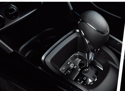
Efficient AT6 transmission + Quickshift technology

With its dynamic design elements, sleek contours and high ground clearance, the eye-catching aesthetics of the new 2008 SUV Puretech evokes a sense of adventure.