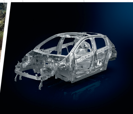
Very High Strength Steel (VHSS) body structure