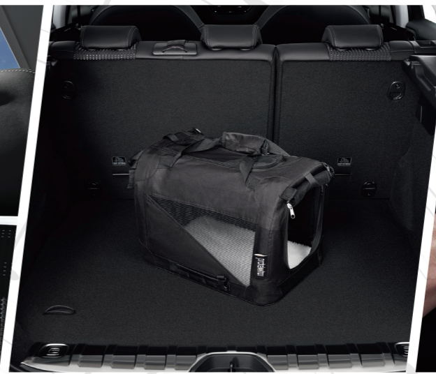
1194L of maximized flat fold boot space