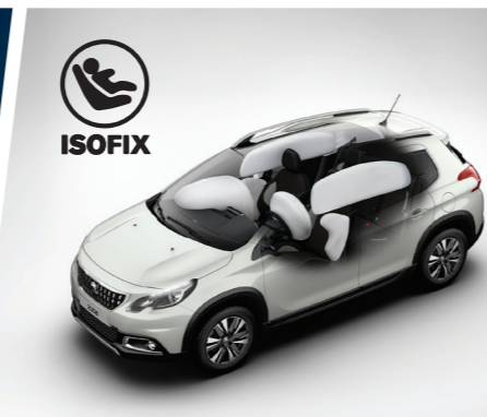
Maximized safety features with 6 airbags + ISOFIX