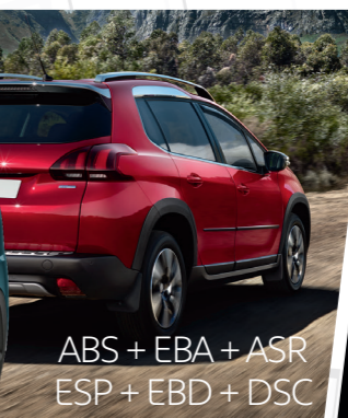
ABS + EBA + ASR ESP + EBD + DSC