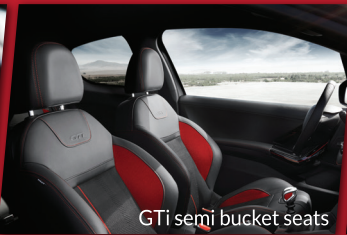
GTI semi bucket seats