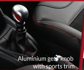
Aluminium gear knob with sports trim