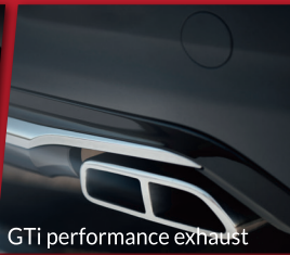
GTI performance exhaust