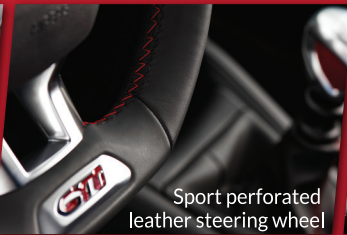
Sport perforated leather steering wheel