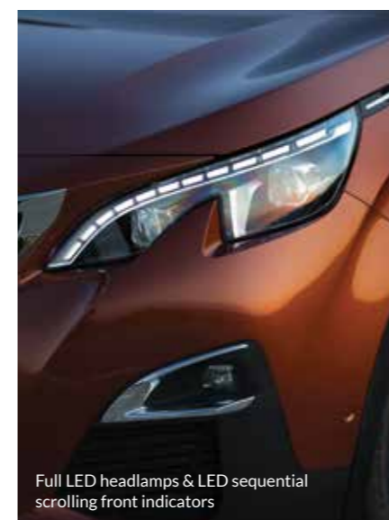
Full LED headlamps & LED sequential scrolling front indicators