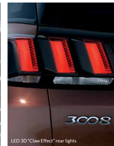
LED 3D "Claw Effect" rear lights