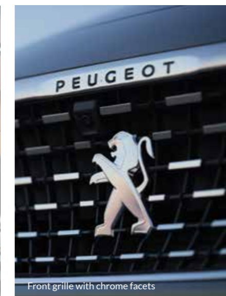
Front grille with chrome facets