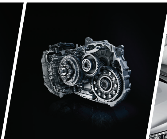
Efficient AT6 with Quickshift technology