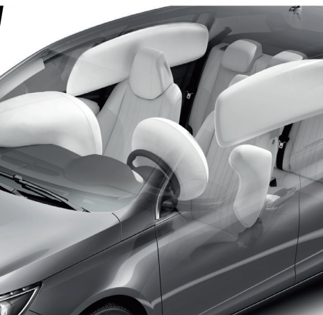
6 airbags plus a full complement of state-of-the-art safety systems