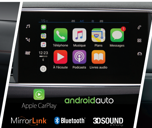
9.7" HD Multifunction Touchscreen with smart device compatibility