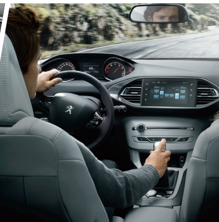
Comprehensive electronic safety aids ESP + ABS + EBD + EBA + ASR + DSC