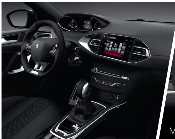
The refined Peugeot i-Cockpit with driver-focused controls