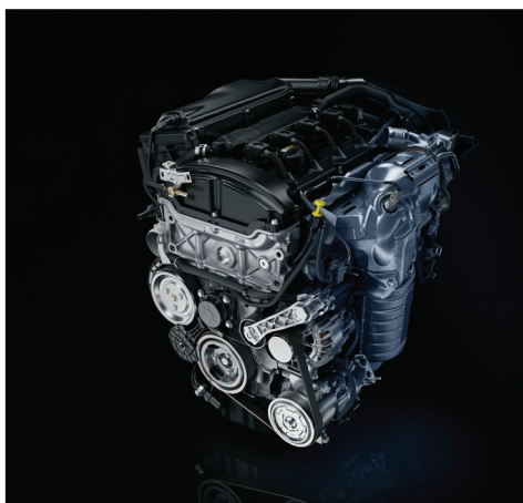
Award-winning 1.6-litre Turbo High Pressure (THP) engine