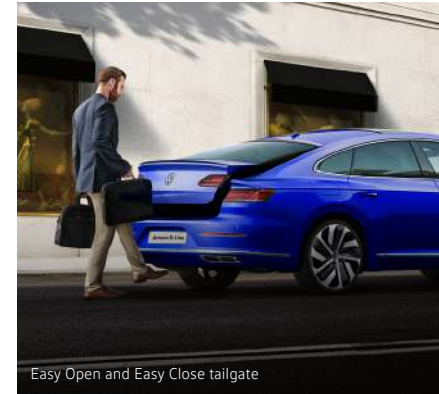
Easy Open and Easy Close tailgate

Need a hand? The Arteon R-Line 4MOTION comes with an electric luggage compartment lid with a hassle-free Easy Open and Easy Close operation.