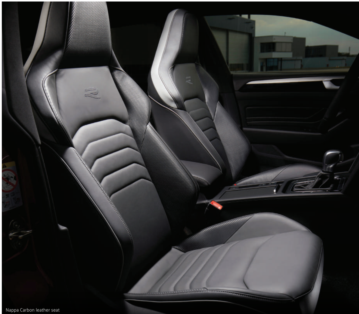
Nappa Carbon leather seat

Beautifully sculpted to offer supreme support and comfort, the ergoComfort Nappa Carbon leather sport seats come with an electric 14-way adjustment for seat height, seat length, seat cushion angle, and backrest angle. For your convenience, the Area View camera also offers a 360° view of your surroundings whether in parking, turning or leaving a driveway.