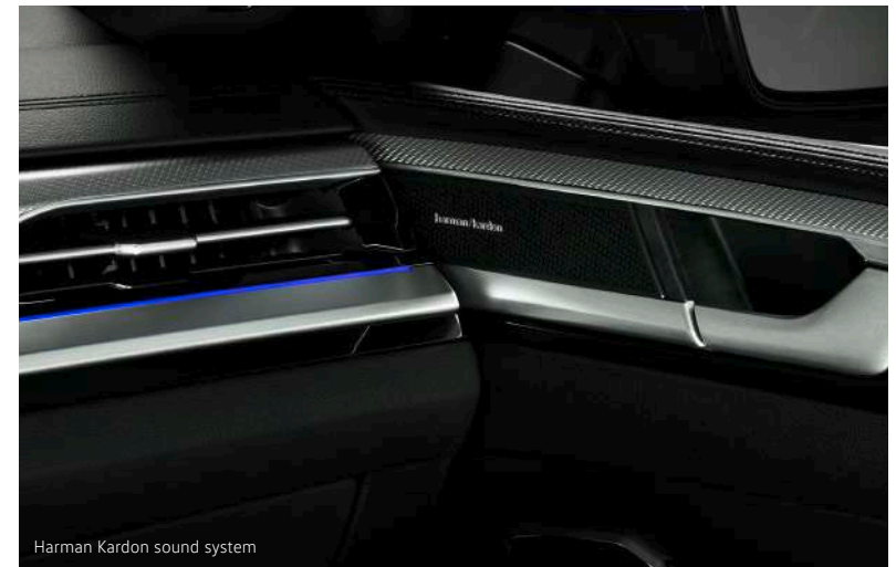
Harman Kardon sound system

The Arteon R-Line 4MOTION comes equipped with a premium 700W Harman Kardon sound system with 12 high-performance speakers including a subwoofer, delivering astounding acoustics.