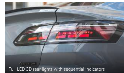
Full LED 3D rear lights with sequential indicators

Experience immersive technology with Digital Cockpit, Discover Pro 9.2" touchscreen navigation infotainment system with gesture/voice control, Wireless App-Connect® (Apple CarPlay, Android Auto) and smartphone wireless charging.