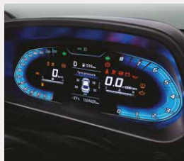
Digital cluster with TFT Multi Information Display (MID)

Step inside and get entranced by its exquisitely appointed, sporty black interiors with colour inserts. Relish the premium ambience every time you take it for a spin.