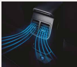
Rear AC Vents