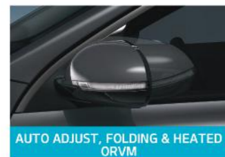
AUTO ADJUST, FOLDING & HEATED ORVM