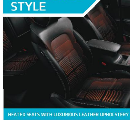
HEATED SEATS WITH LUXURIOUS LEATHER UPHOLSTERY