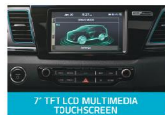
7" TFT LCD MULTIMEDIA TOUCHSCREEN