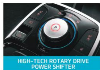
HIGH-TECH ROTARY DRIVE POWER SHIFTER