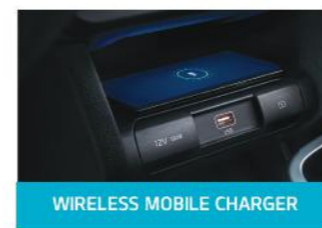
WIRELESS MOBILE CHARGER

Power. Torque. Fun. The Niro EV is powered by an electric motor good for 201hp and 291 lb-ft of torque. Niro EV isn't just one of the most efficient Kia SUVs, it's also the torquiest SUV in the segment.