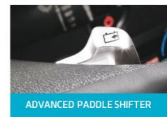
ADVANCED PADDLE SHIFTER