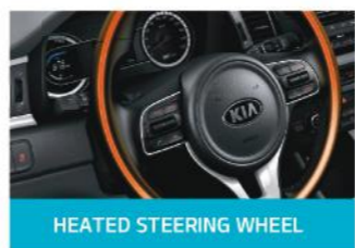
HEATED STEERING WHEEL