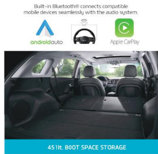
45 lit. BOOT SPACE STORAGE