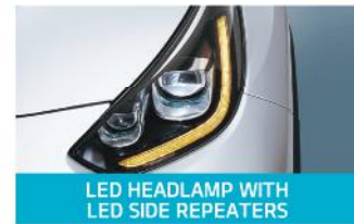
LED HEADLAMP WITH LED SIDE REPEATERS