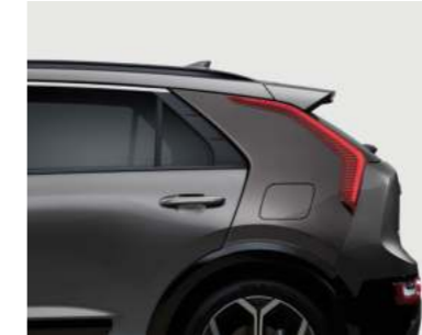
Dark Grey C-Pillar