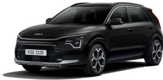
Aurora Black Not available PHEV Light