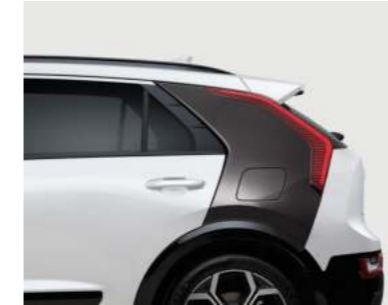
Dark Grey C-Pillar