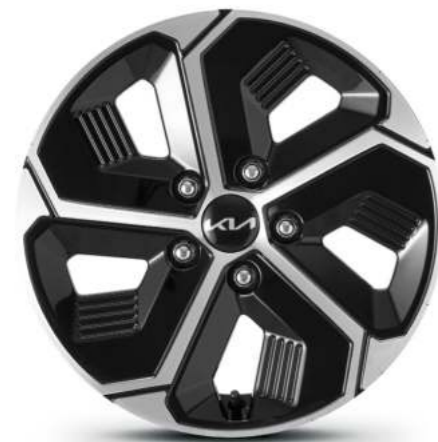
16" ALLOY (Light & Earth models)