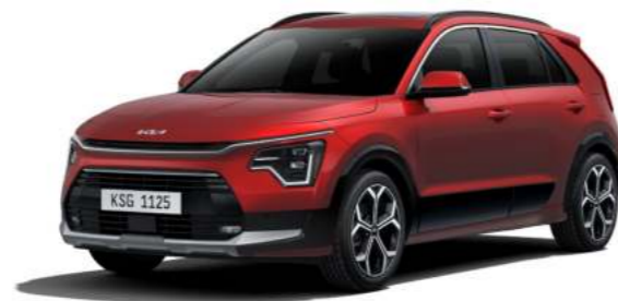
Runway Red Not available PHEV Light