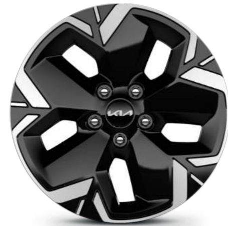
17" ALLOY (EV models)