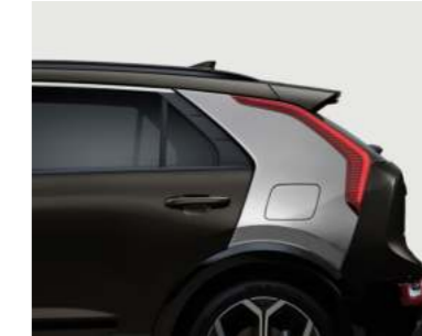
Light Grey C-Pillar