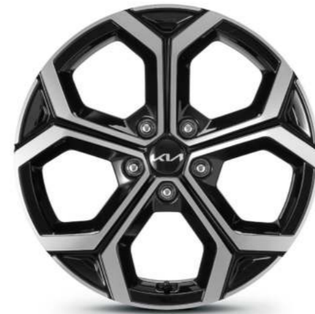
18" ALLOY (Water & GT-Line models)