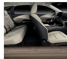
Solis White 02