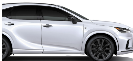
White Nova | 083 | F SPORT Performance only