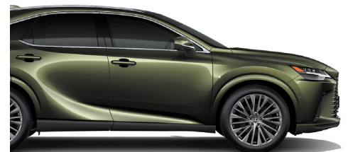
Terrane Khaki | 6X4 | n/a F SPORT Performance