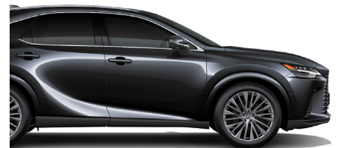
Graphite Black | 223