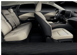
Solis White 03