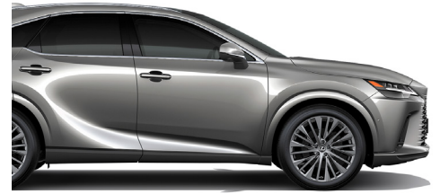
Titanium | 1J7 | n/a F SPORT Performance