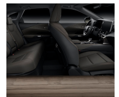
Dark Sepia 47

THE IMAGES AND CONTENT IN THIS BROCHURE HAVE BEEN SOURCED GLOBALLY AND MAY DIFFER FROM NEW ZEALAND SPECIFICATION.