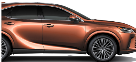
Sonic Copper | 4Y5