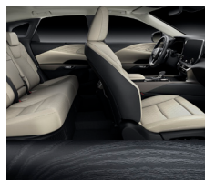
Solis White 01