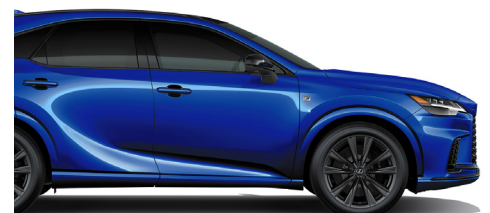
Cobalt | 8X1 | F SPORT Performance only