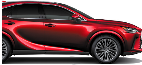
Burgundy | 3R1 | n/a F SPORT Performance