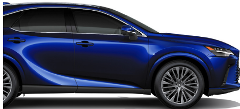
Deep Blue | 8X5 | n/a F SPORT Performance