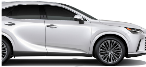
Sonic Quartz | 085 | n/a F SPORT Performance