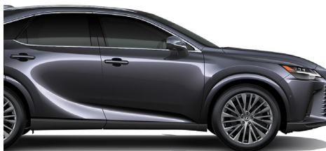
Sonic Shade | 1L1