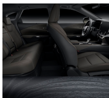
Dark Sepia 46