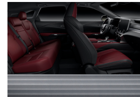
Dark Rose 34