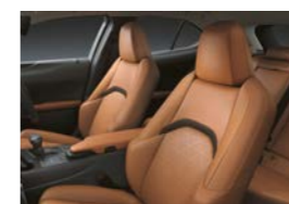
Ochre | 41