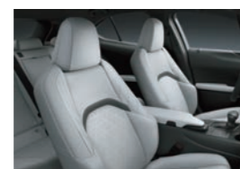
White Ash | 10