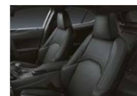
Black | 20