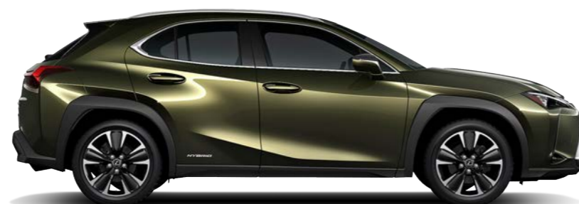
Terrane Khaki | 6X4