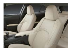
Rich Cream | 0