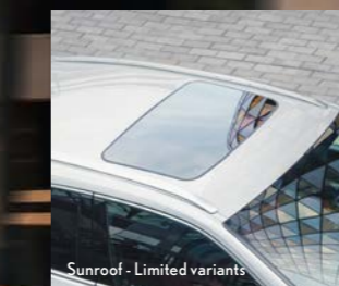
Sunroof - Limited variants