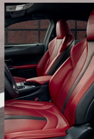
F SPORT FLARE RED SHOWN

The integration of exclusive F SPORT refinements and sports tuning gives drivers a strong sense of oneness with the car, heightening the immediacy and thrill of sports driving.