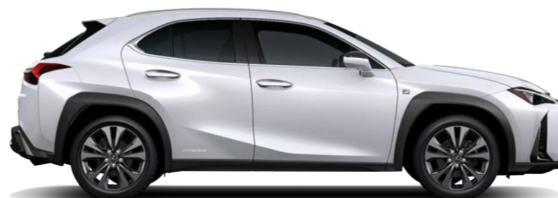
White Nova | 083 | F SPORT only