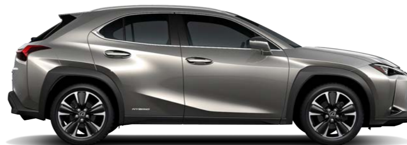
Titanium | 1J7