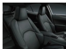
Black | 20