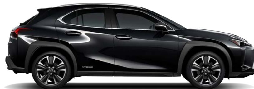
Graphite Black | 223