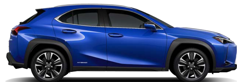
Celestial Blue | 8Y6