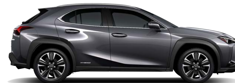
Basalt Mica | 1H9