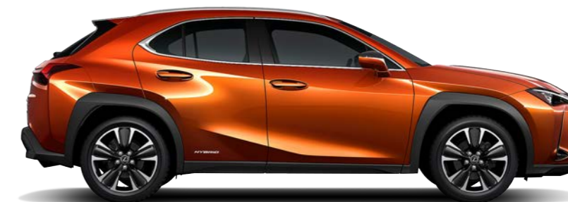
Blazing Carnelian | 4Y1