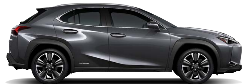
Sonic Shade | 1L1 | n/a UX 250h FWD