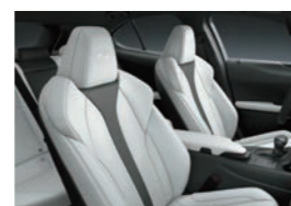
F SPORT White | 01