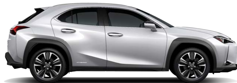
Sonic Quartz | 085 | n/a F SPORT