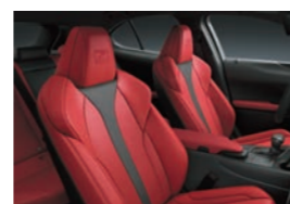
F SPORT Flare Red | 31