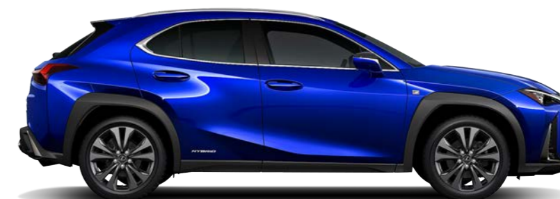
Cobalt | 8X1 F SPORT only