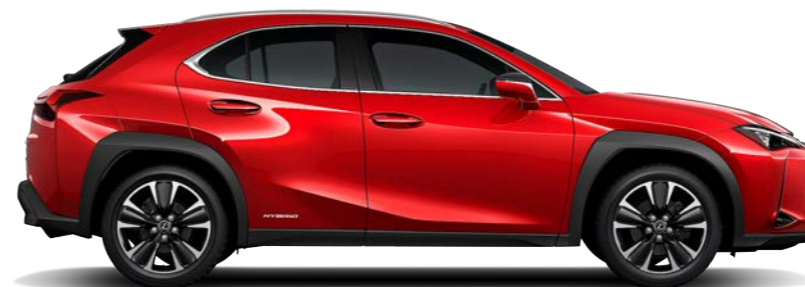
Caliente | 3T2