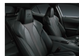
F SPORT Black | 21