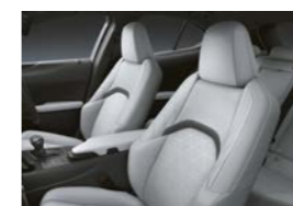
White Ash | 10