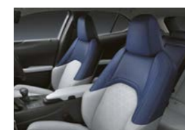
Zephyr Blue | UX 300e Limited only | 80

Paint, upholstery and interior trim colours shown in this brochure may differ from actual colours due to variations in printing processes.