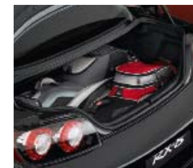
◀ Bags of room. This sports car has plenty of space for your gear to go along.