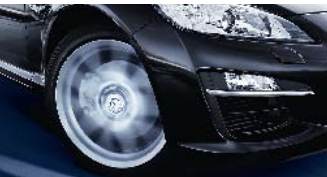
Big on control. Distinctive 18-inch alloy wheels for superior handling.