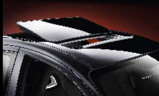
◀ Chase the sun. Manual and Automatic models are equipped with a power-operated sun-roof.