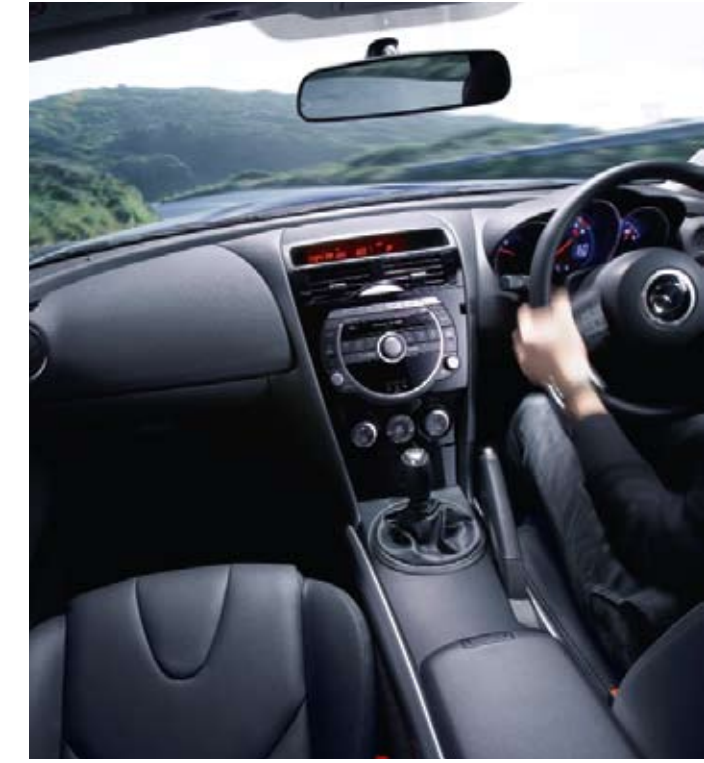
▲ Gets a hold on you. Sporty front seats are shaped to hold you firmly yet provide superb levels of comfort.