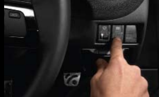
◀ DSC does as you say. Handy button gives you full control over DSC function.

Beautifully balanced. 50:50 weight distribution, low centre of gravity and sports tuned suspension result in precise, controlled handling.