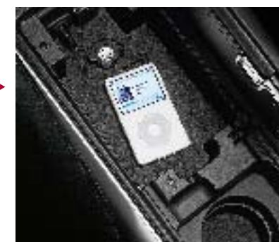
▶ Tuned in. Auxiliary jack connects portable audio players. Recharge portable devices with 12V power outlet.