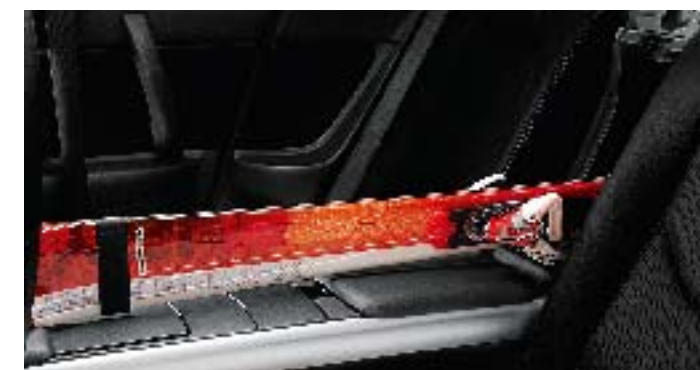
▲ Living space. Large rear tunnel console helps to make life easy. Boot through box lets you carry awkward or large items.