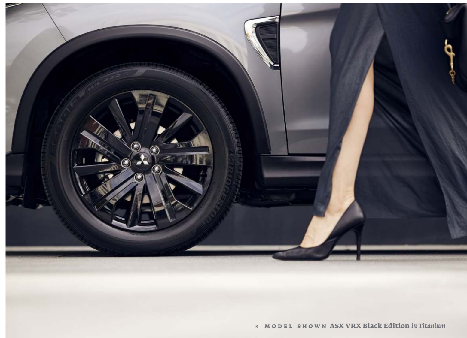
» MODEL SHOWN ASX VRX Black Edition in Titanium