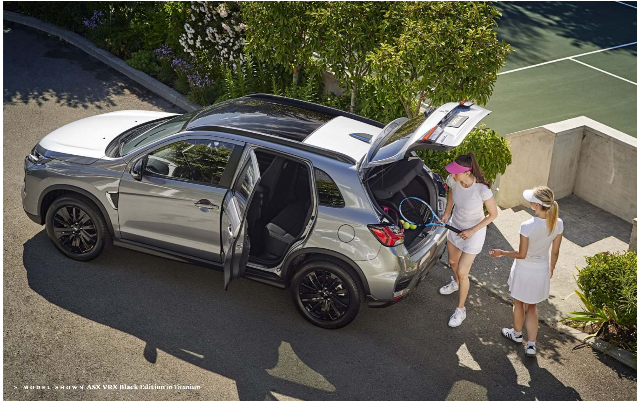
» MODEL SHOWN ASX VRX Black Edition in Titanium