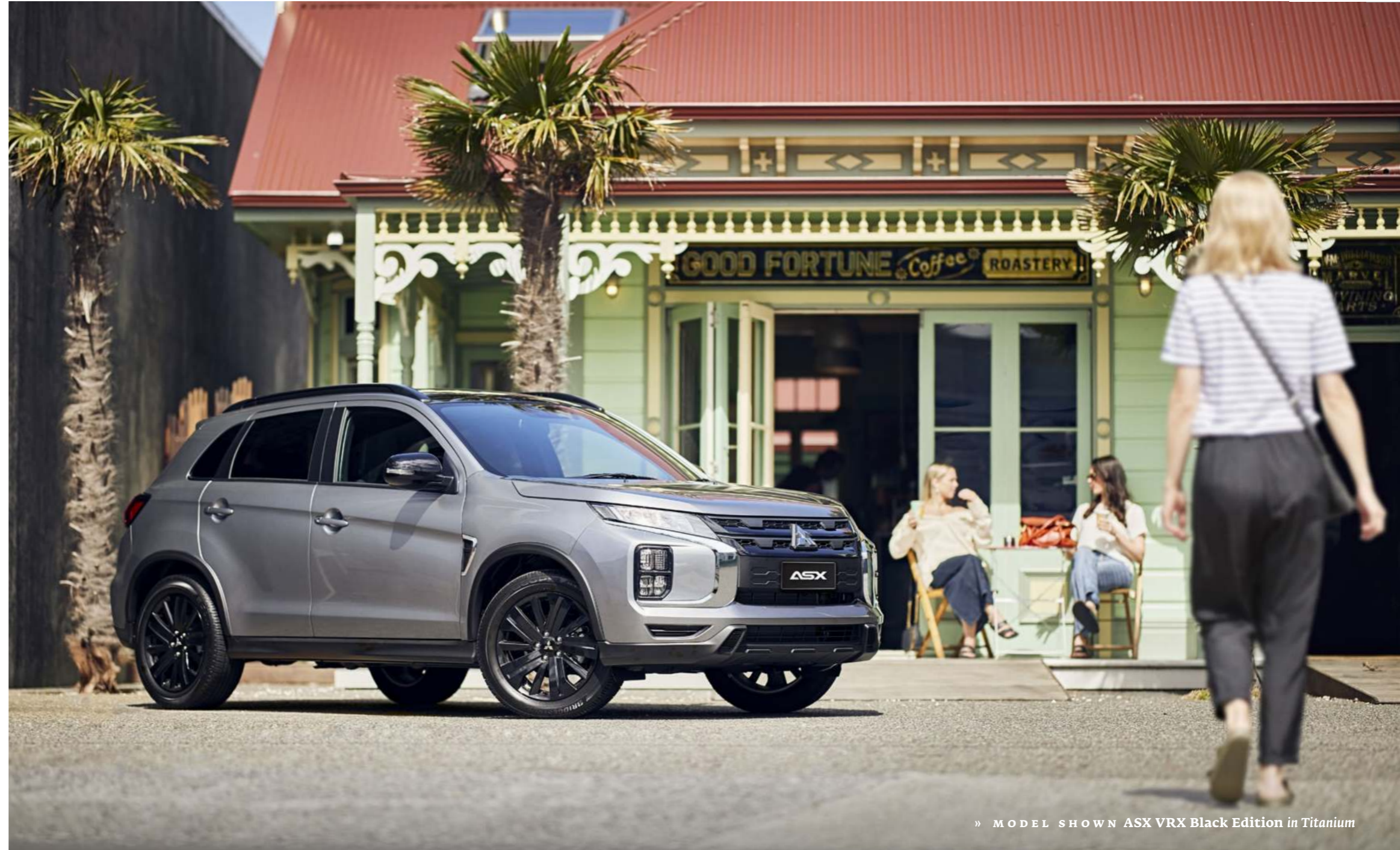
» MODEL SHOWN ASX VRX Black Edition in Titanium

Should you wish to take away, settle in for some 'you' time as you glide away from the curb. What also goes well with coffee is your own choice of music, and that's all available with a flick of your finger through the SDA system for Apple CarPlay or Android Auto. The touch screen also brings your favourite radio station into your private café on wheels.