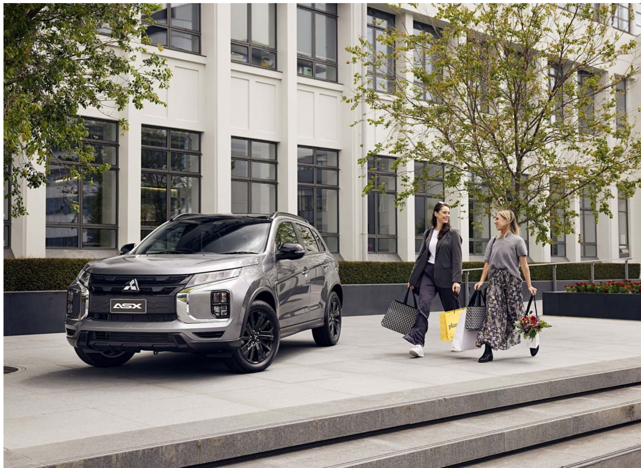
» MODEL SHOWN ASX VRX Black Edition in Titanium