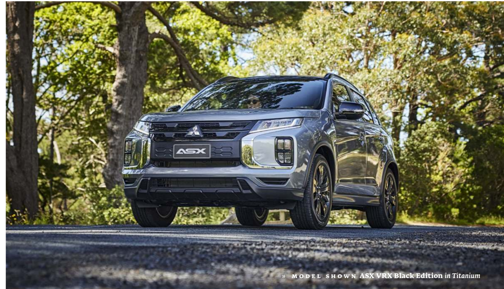
» MODEL SHOWN ASX VRX Black Edition in Titanium

As you drive out onto the road, more ASX safety systems are activated. ATC (Active Traction Control) and ASC (Active Stability Control) monitor your car's contact with the road surface and ensure you're keeping the safest course. Check.