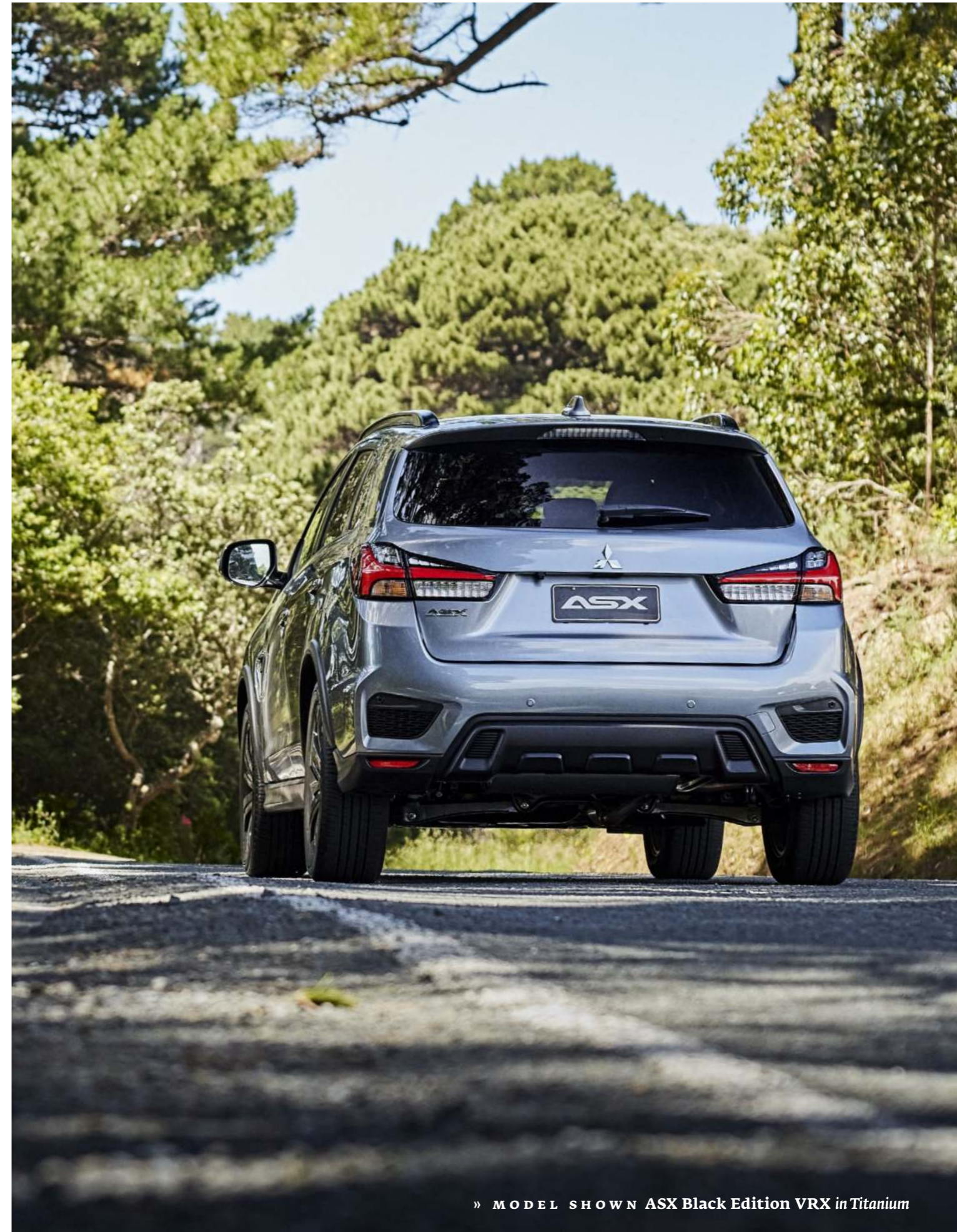
» MODEL SHOWN ASX Black Edition VRX in Titanium