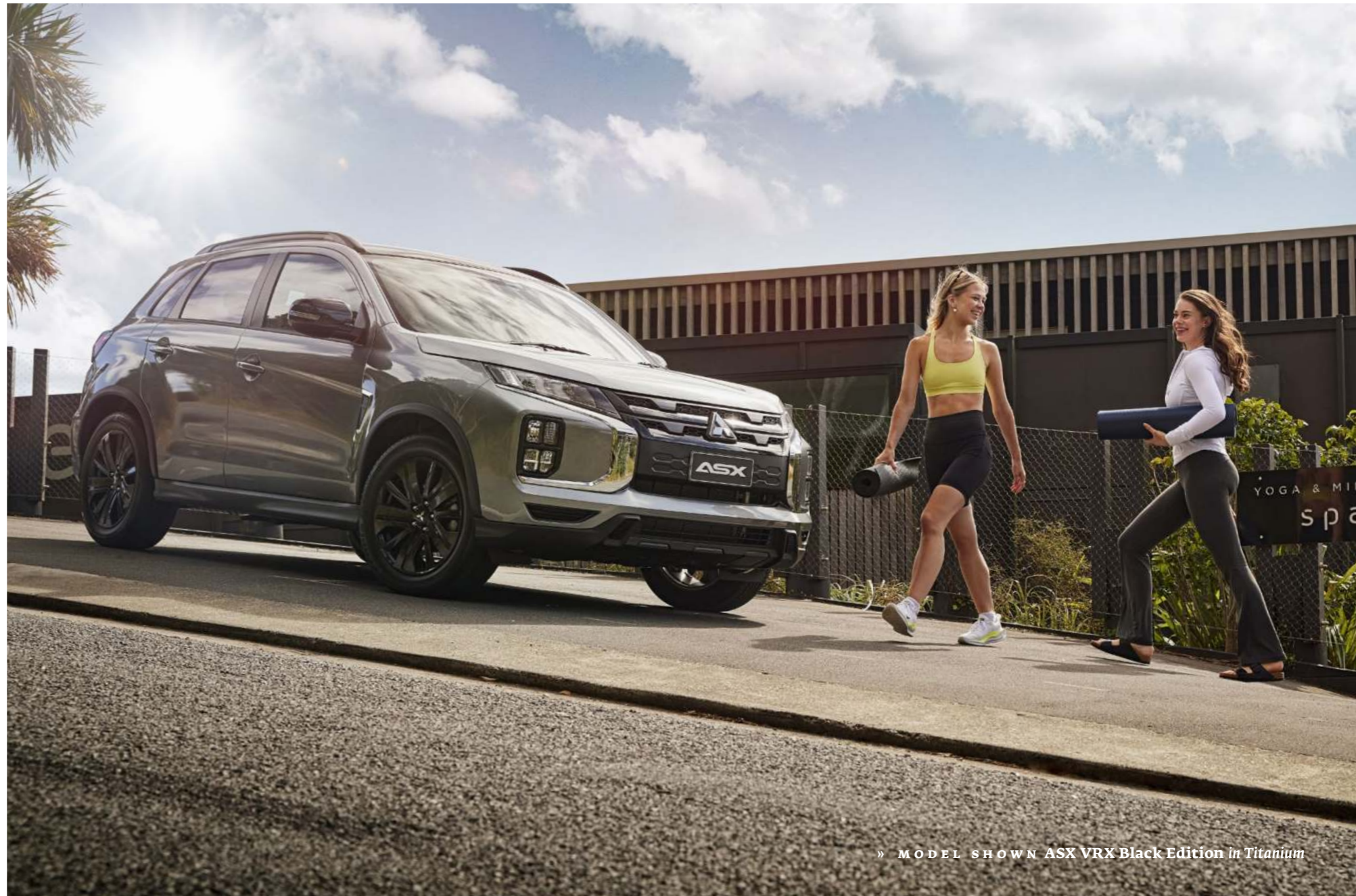
» MODEL SHOWN ASX VRX Black Edition in Titanium

* Available in Black Edition and VRX Black Edition.