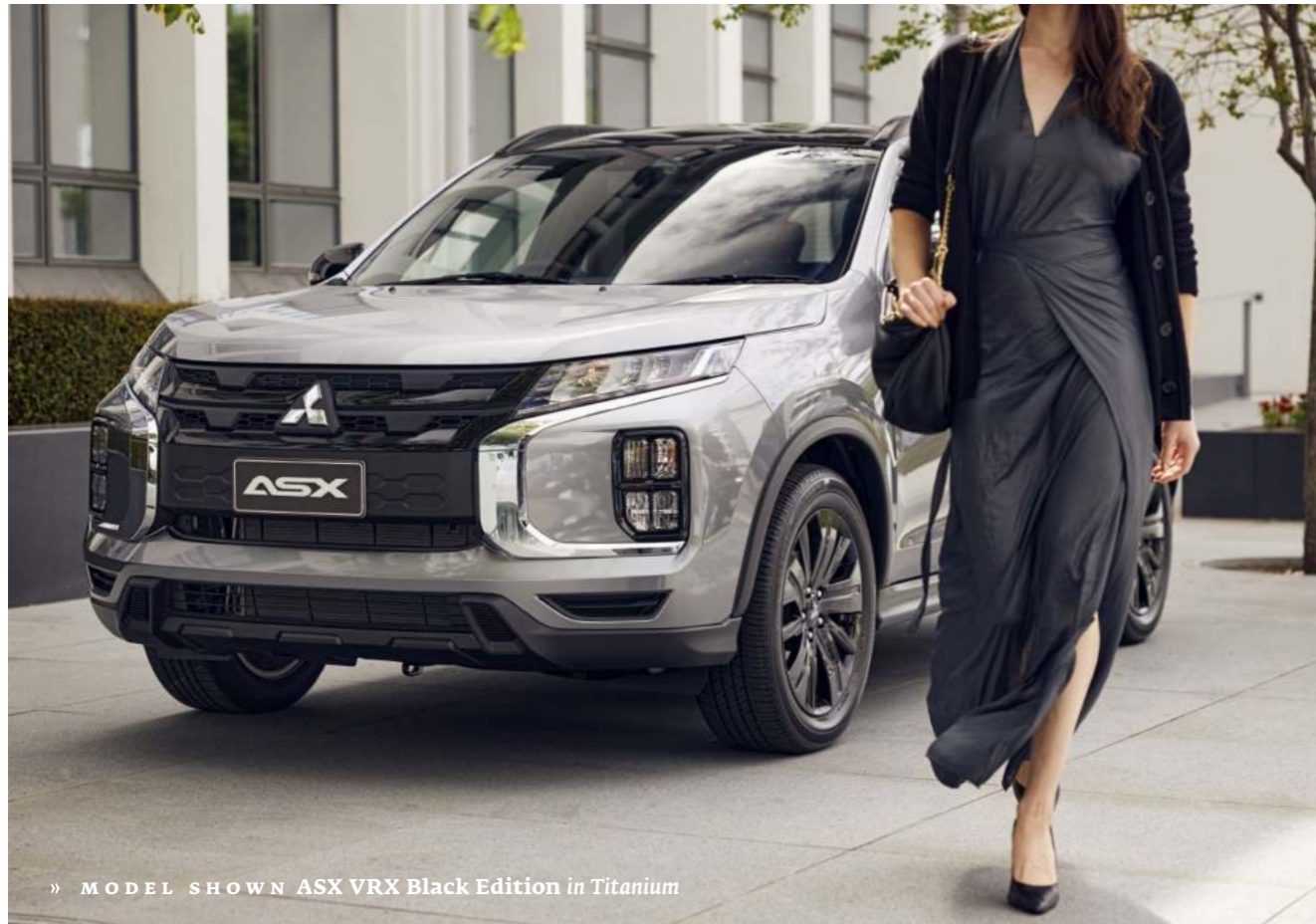
» MODEL SHOWN ASX VRX Black Edition in Titanium