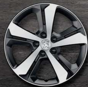
17" Rubis alloy wheels -Allure