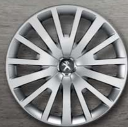
15" steel wheels with Ambre trims - Access