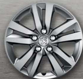
16" Quartz alloy wheels - Active