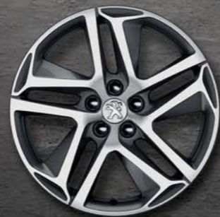
18" Saphir alloy wheels - Allure optional