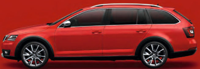
CORRIDA RED UNI