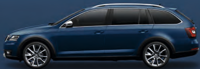
PACIFIC BLUE UNI