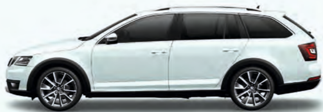
LASER WHITE UNI