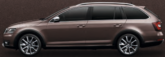
SPACE BROWN METALLIC