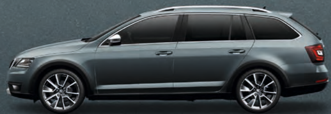
QUARTZ GREY METALLIC