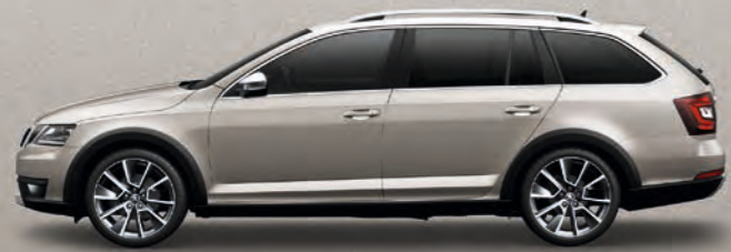
CAPPUCINO BEIGE METALLIC