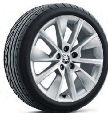
18" BRAGA alloy wheels