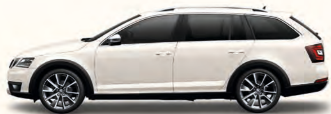
CANDY WHITE UNI