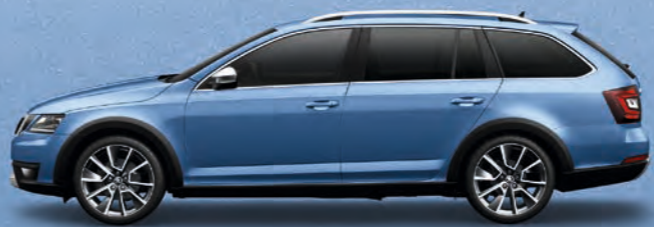
DENIM BLUE METALLIC