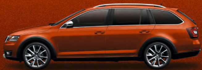
RIO RED METALLIC