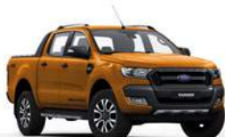
Pride Orange (Wildtrak)