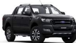
Black Mica (XLT, Wildtrak, XLS)