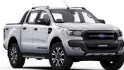
Cool White (XLT, Wildtrak, XLS, Single Cab/Chassis Cab/Base)

Park almost anywhere. The new Ranger combines a rear view camera with front and rear parking sensors to make parking easier.