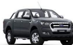
Metropolitan Grey (XLT)