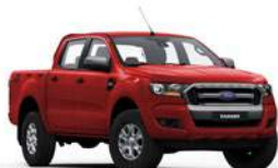
True Red (XLS)