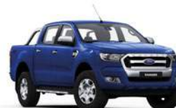
Aurora Blue (XLT)