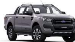
Aluminium Metallic (XLT, Wildtrak, XLS)