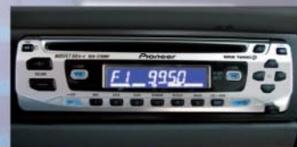
• New MMAD Single-In-Dash CD Player and AM/FM Tuner with 2 Speakers (Dealer Option)