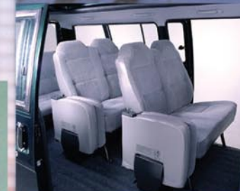
• Dual Sliding Doors with Large Openings