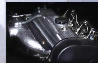
• Powerful yet Economical 4D56 SOHC, Diesel Engine, EURO 1 Compliant

And with Mitsubishi's extensive dealer network and parts availability, the L-300 Versa Van simply edges out the competition.