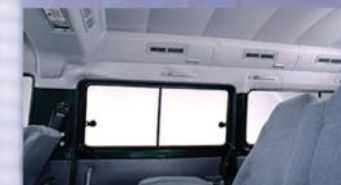
• Wrapped-Around Dual Air-Con System