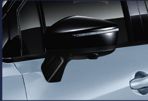
Black Finish Outside Door Mirrors***