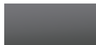
Gun Metallic 1