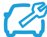
Maintenance Alert and Reminder