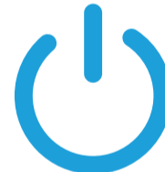
Remote Engine Start / Stop