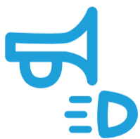
Remote Horn and Lights