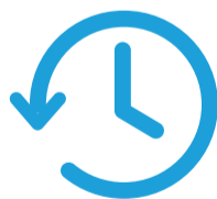
Driving and Journey History