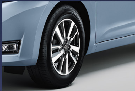
New 16" Alloy Wheel Design*