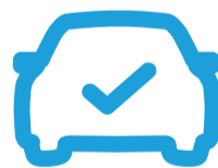
Vehicle Health Report