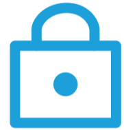
Remote Lock / Unlock