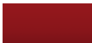
Cayenne Red 3