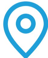
My Car Finder