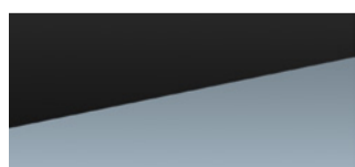
Moon Pearl Gray with Black Roof 2

Nissan Philippines, Inc. reserves the right to alter, delete, or enhance features and specifications without prior notice depending on market requirements.