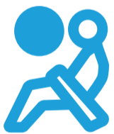
Automatic Collision Notification